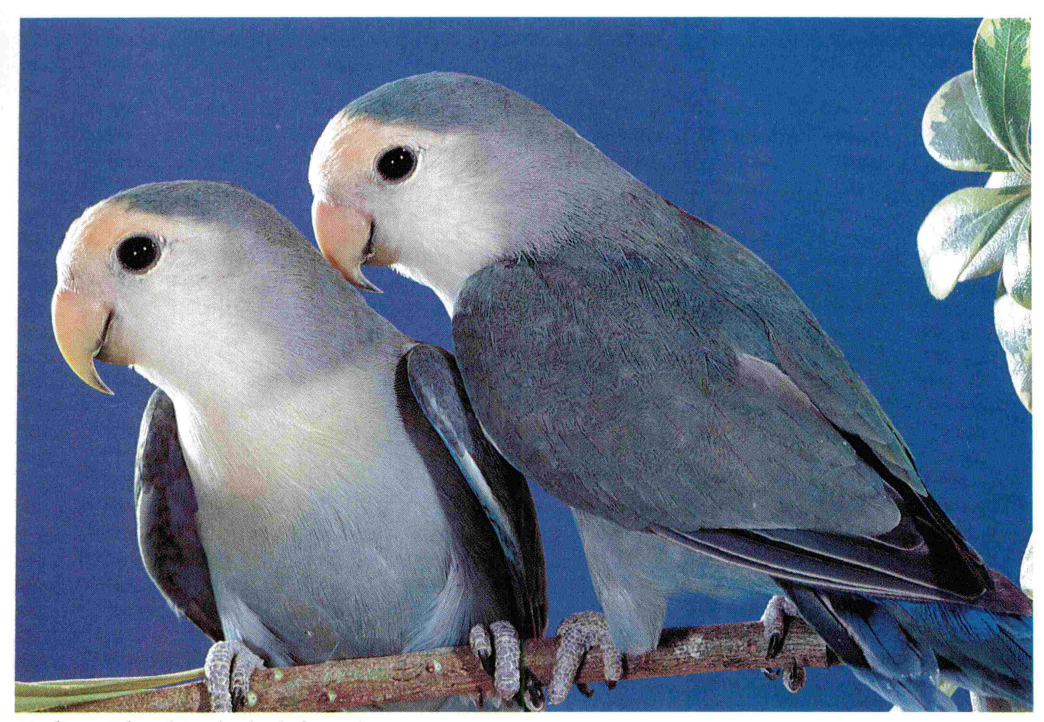
Medium Blue (single dark factor)