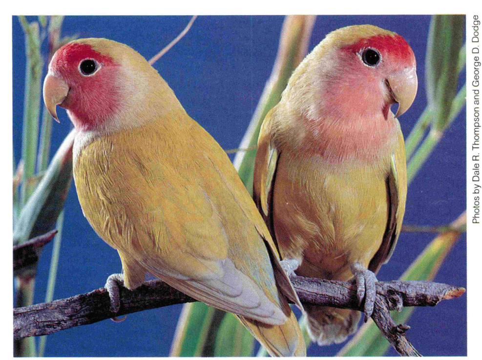
Imperial Golden-cherryhead (American Yellow)

The Whitefaced actually first appeared in Belgium in the seventies, however it was not until the early eighties that