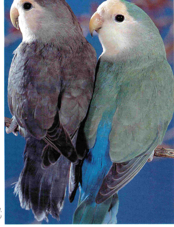
Dark Blue (left, Blue (right)