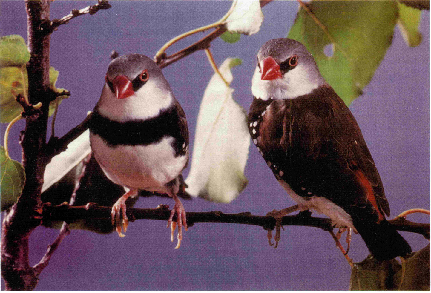
The Diamond Fire-tailed Finch comes from many parts of Australia. It is commonly known to U.S. aviculturists as the Diamond Sparrow. It is not, however, related to sparrow-like birds.