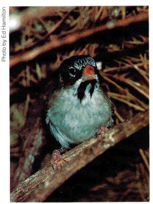
Scaly-crowned Weaver, male

and strength, and even these will be vigorously chivied away from the vicinity of the Scaly-crowned's nest... They are quite willing to go to nest... A spherical nest is built with the entrance at the side, and their eggs are like those of a House Sparrow, only smaller.'