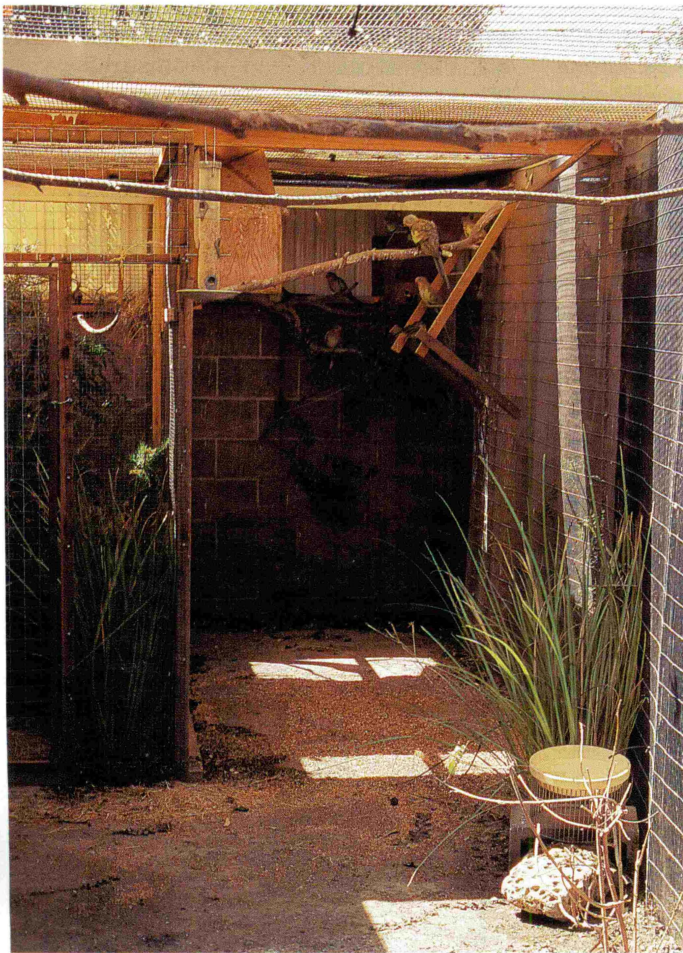
This section of the divided aviary houses the psittacines in the collection. Note the section closed off with the two-inch wire mesh. This allows the weavers to use the entire flight but keeps the Princess of Wales Parakeets from entering the weavers' private domain.