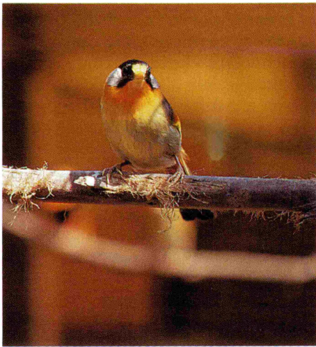
Silver-eared Mesia in Long's planted flight.