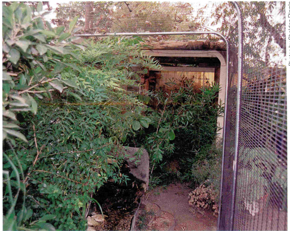
An inside view of the planted finch section of the aviary.