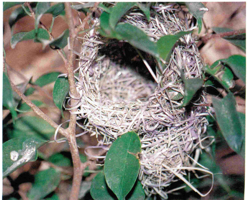
A close-up of a weaver's nest.