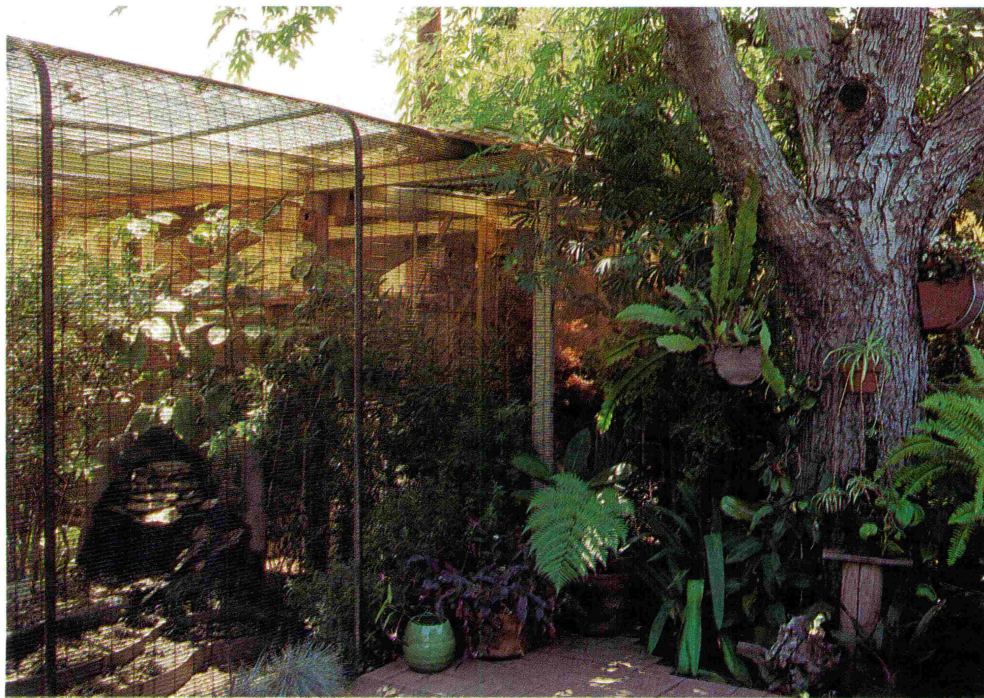
A view of Long's garden aviary showing the large Silver Maple tree, various species of bromeliads, Boston Ferns, several epiphyllum species, a Chamaedorea Palm, a China Doll plant and the front of the aviary. A small, running stream and waterfall was achieved by tiering the ground and laying down a black sheet of plastic on the highest level. The recycling pump raises water up to the top of a short stack of rocks and falls down to wander among smooth river rocks. The birds love it, as their singing, bathing and constant visits to the water indicates. It was thoughtfully designed so no young birds drown.