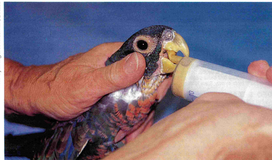
Care is taken during the handfeeding process to eliminate the risk of aspiration. This young Bronze-winged Pionus is well feathered.