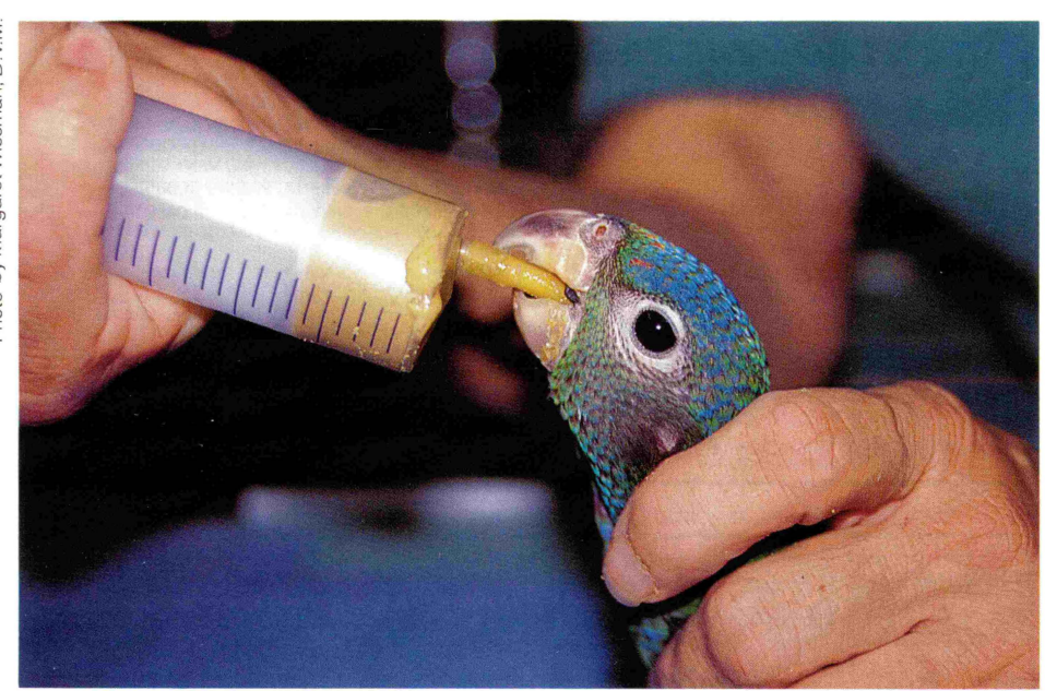
All babies are fed when their crops are empty. All syringes are sterilized after each use. This is a young Blue-beaded Pionus.