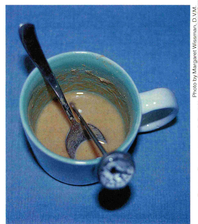
The author uses Kaytee Exact for handfeeding Pionus parrots. The temperature of the handfeeding formula is always tested.

The Pionus are an ideal bird as they are not noisy, they do not chew, they are small and are very captivating.