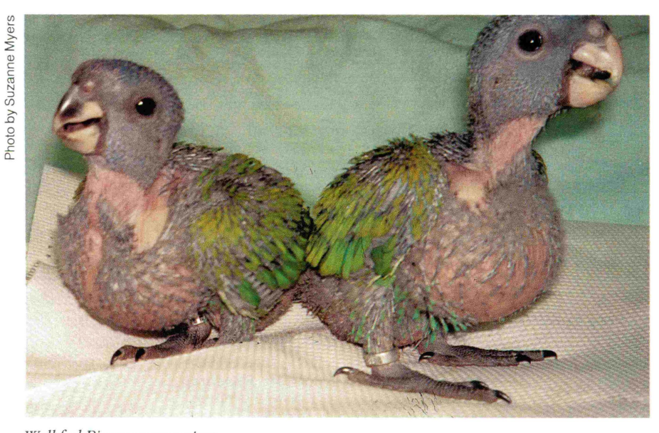
Well fed Pionus youngsters.

This year, I have pulled my Blueheadeds somewhat later and put them in a cage 1/2 \times 1 in. wire (when feathered) giving them toys while introducing them on Kaytee Rainbow. This seemed to eliminate any stress which I felt had activated their wheezing.