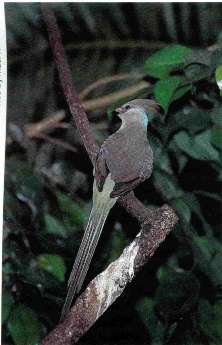
The Blue-naped Mousebird is one of six species found only in Africa. Though somewhat uncommon in aviculture, they are excellent aviary subjects.

Although mousebirds are very attractive and interesting softbills, they have not become extremely popular in aviculture. The six species of this family ( Coliidae ) are so different from all other birds that they are placed in their own order ( Coliiformes ). In nature, they are only found in Africa. In captivity, they are rarely displayed in zoological collections. This is a shame as their behavior is very interesting.*