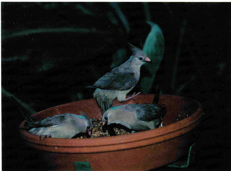
Mousebirds are mainly fruit eaters in captivity. They also appreciate cooked rice and dark greens.

In the summer of 1988, I found a fallen nest which contained two baby Blue-naped Mousebirds. Only one was alive. From the condition of the baby that had died, I assumed that another bird, possibly a pitta, had attacked it.