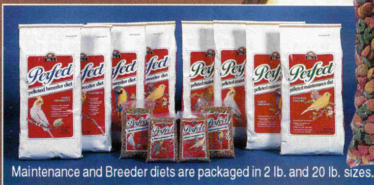
Maintenance and Breeder diets are packaged in 2 lb. and 20 lb. sizes.