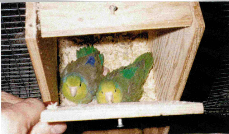
Pacific Parrotlets ( Forpus coelestis ) are the most common found in the U.S. Here the male (right) and female sit in the nest box with a newly hatched baby.