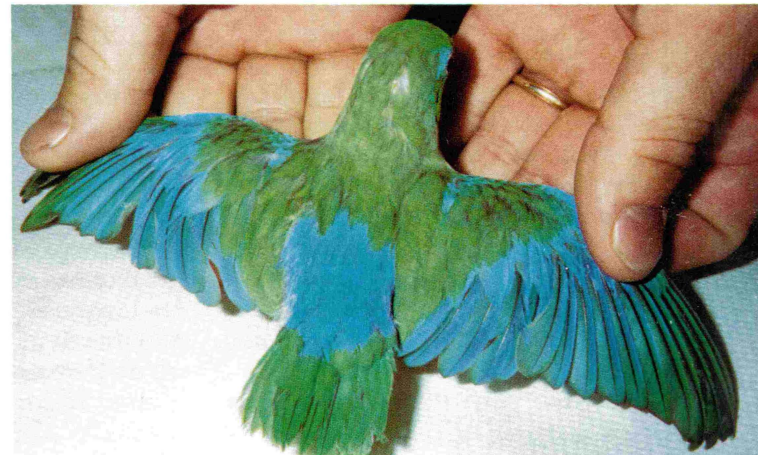
Male Spectacled Parrotlets ( Forpus conspicillatus ) are perhaps the most brilliantly colored with bright blue-violet on the wings, rump and encircling the eyes.