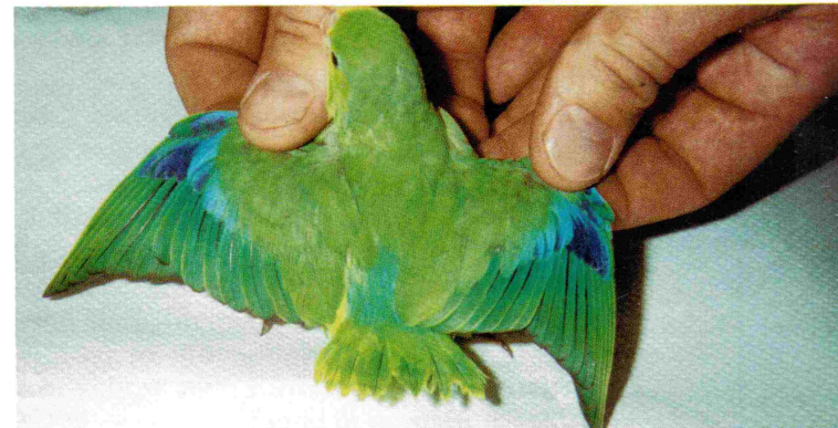
Green-rumped Parrotlet ( Forpus passerinus viridissimus ) males lack the blue coloring as on the rump of other male parrotlets. Their primary wing feathers are cobalt-blue while the secondaries are turquoise.