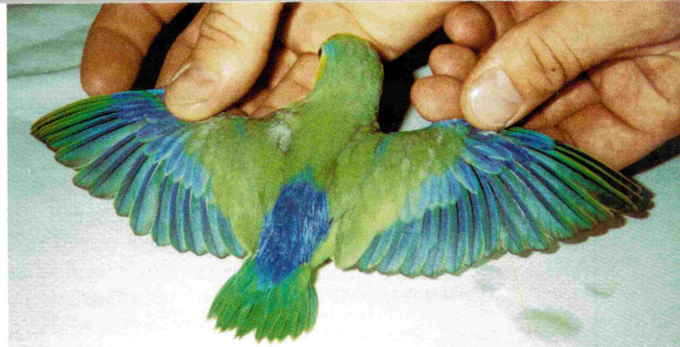
Male Pacific Parrotlets have a cobalt-blue streak extending back from the eye as well as cobalt-blue on the rump and wings.