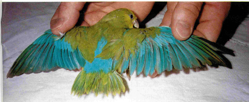
One of the larger parrotlet species, Mexican Parrotlet ( Forpus cyanopygius ) males have bright turquoise feathering on the rump and wings.