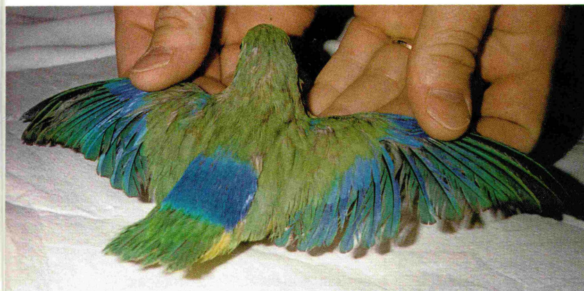
Blue-winged Parrotlets ( Forpus xanthoptergius ) are sleek, streamlined birds. The males have a deep blue rump patch and turquoise on the wings.