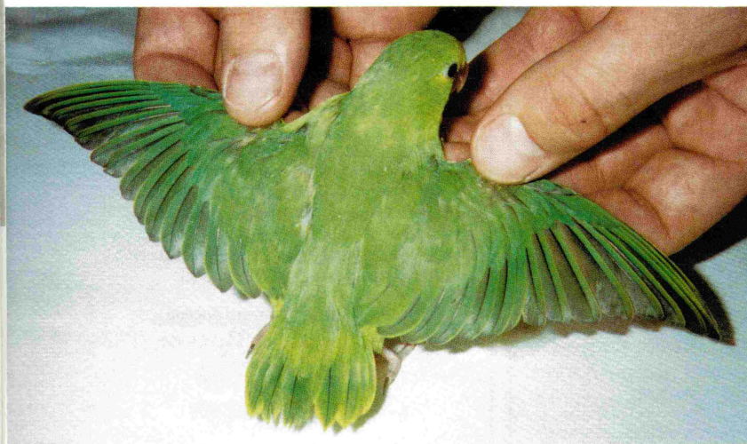
Parrotlets are sexually dimorphic. The female is usually all green as in this Pacific Parrotlet hen.