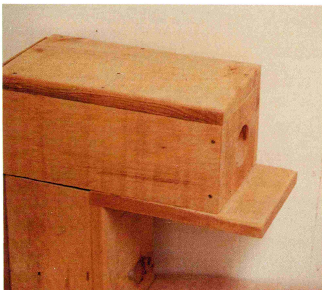
A photograph of our reversed boot nest box. The nest area is very dark and gives a sense of security, one of the reasons for our success.