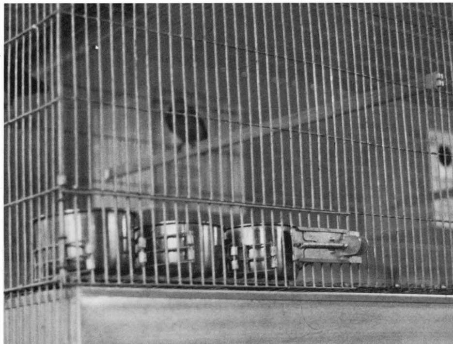
Picture showing the three feed cups. The cup mounting rings were made from scrap. They swing out for cleaning and servicing.