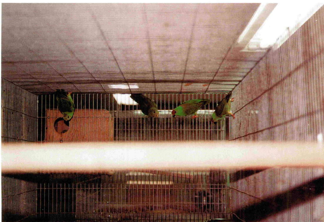
Photo shows the depth of the flights. Note typical hanging position of the hen on the left. The fledged baby is third from the right. Notice the horn colored beak.