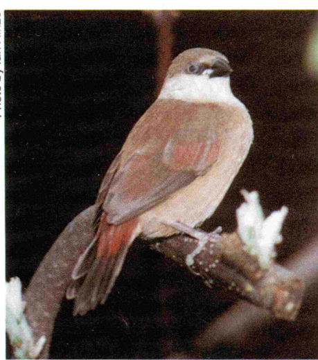
Fledgling Rosy-rumped or Sundevall's Waxbill (Estrilda rhodopyga). Note crimson of rump and wings and lack of white outer tail feathers.

looks around to see all is well before uttering a low cry to its mate. Sometimes the sitting bird will quickly appear before the relieving bird enters, or it will wait before its mate is actually in the chamber before coming out. Once out, the relieved bird never strays far from the vicinity of the nest and is able, at least in captivity, to feed/drink/rest while, at the same time, keep guard. Should one enter the birdroom, the non-sitting bird will utter an alarm call which brings the