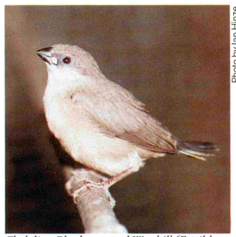
Fledgling Black-rumped Waxbill (Estrilda troglodytes). Note white outer tail feathers.

sitting bird out of the nest immediately.