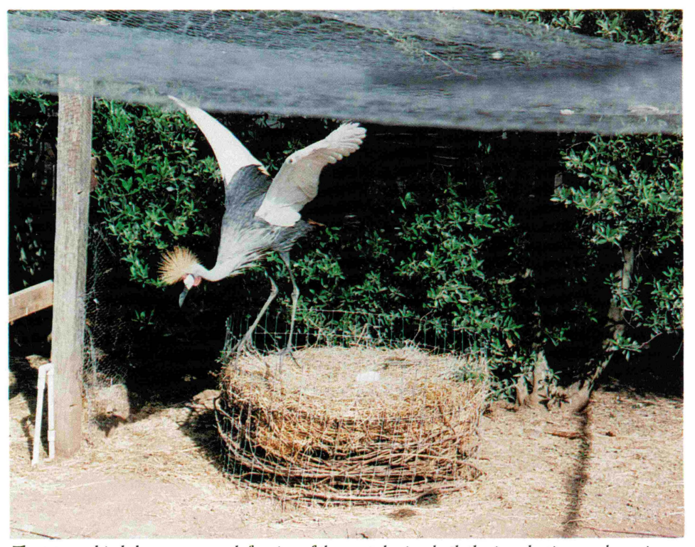
The parent birds become very defensive of the nest during both the incubation and rearing times. A large amount of straw was used for nesting material.

Crowned Cranes spend most of their time on the ground grazing on grasses and hunting small mammals, reptiles