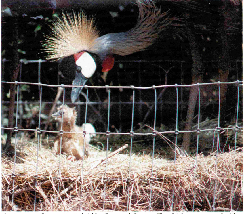
An average of two eggs are laid by Crowned Cranes. The chicks are covered with a tawny-brown down and are attentively cared for by both parents.