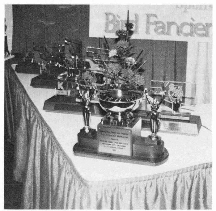
1992 Scannell Award Trophy