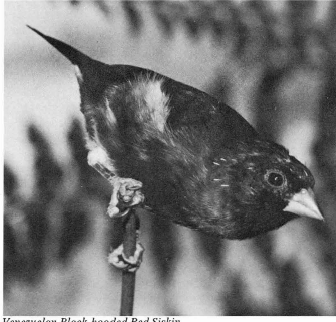
Venezuelan Black-hooded Red Siskin

Please help us show that "Aviculture is conservation, too!" by enclosing your donation in the envelope provided. Aviculture and the birds thank you.