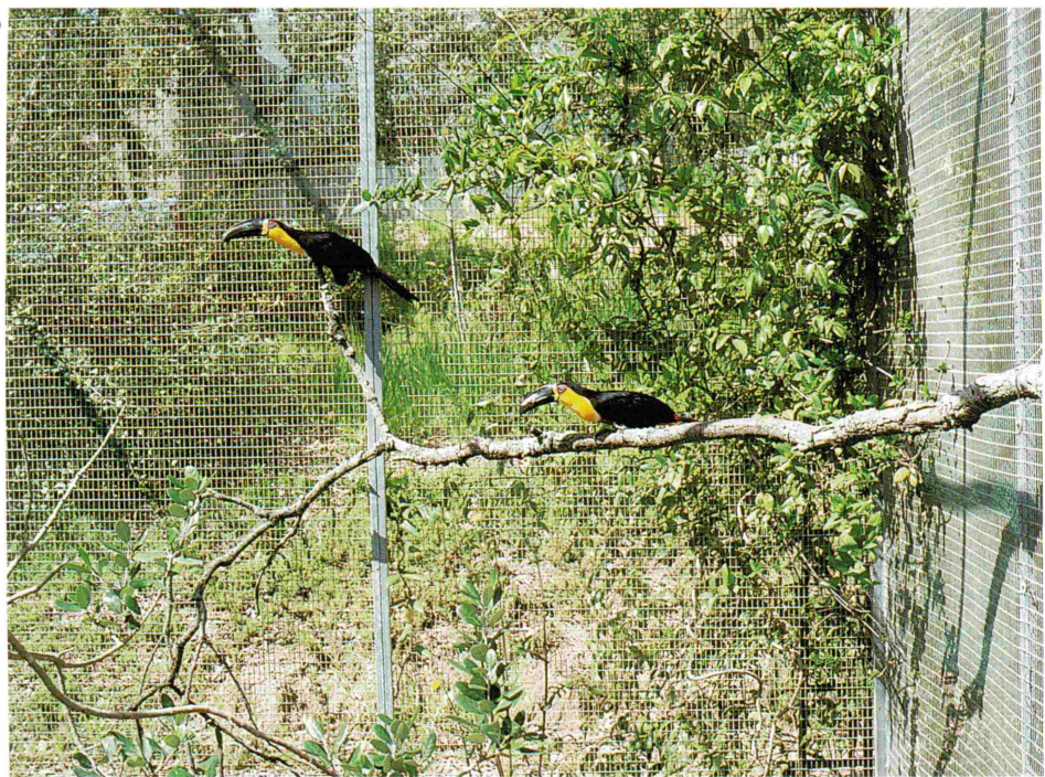
Breeding pair of Ariel Toucans at the author's breeding facility. The male of this pair is seventeen years old.