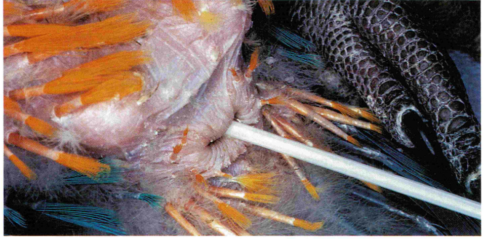
A simple cloacal swab can be used to detect birds that are actively shedding polyomavirus.