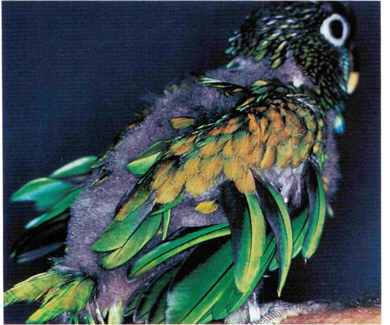
PBFD virus infections can cause dramatic feather loss in young psittacine birds. This Pionus Parrot neonate was completely normal several weeks before this picture was taken. The baby was infected when the breeder introduced birds from another collection into the nursery without testing for PBFD virus.