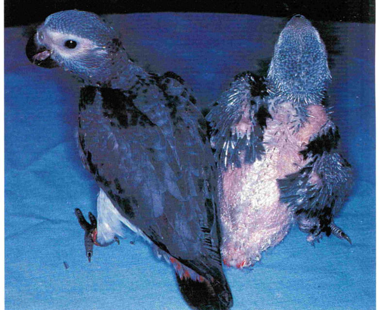
The African Grey Parrot with normal feathers was experimentally vaccinated for PBFD and was resistant to infection. In this picture, the experimentally vaccinated bird is standing next to a PBFD positive African Grey Parrot the same age. This contrast demonstrates the degree of feather damage induced by the PBFD virus in young birds.