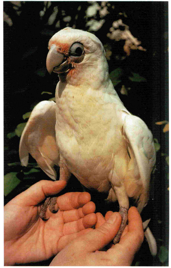
Few bird breeders, pet shop owners or bird owners would pass up a Little Corella that appeared as healthy as this bird. However, this bird has PBFD virus that was diagnosed using the DNA probe test. The bird was found to be PBFD virus positive using the blood test two months before any feather changes could be detected.