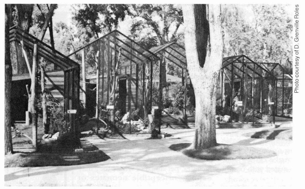
A view of some of the attractive, spacious, well groomed aviaries on the grounds of Tracy Aviary, Liberty Park, Salt Lake City, Utah.

For more than 50 years, Tracy Aviary has displayed the finest collection of birds in the Intermountain Region for the enjoyment and education of the people of Utah. Today's Tracy Aviary is better than ever before, with over 220 species of birds from six continents, including many native to Utah. Tracy Aviary takes conservation seriously, and the breeding of rare and endangered species of birds is a major part of the work at the Aviary. More than 30 different kinds of birds in the collection are listed as endangered. The aviary is located in the southwest corner of Liberty Park in Salt Lake City, and is open from 9:00 a.m. to 4:30 p.m. during the winter, and 9:00 a.m. to 6:00 p.m. in summer.