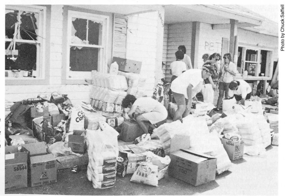
At a local drop-off point in the heavily damaged area, people come, ask for, and get . . free parakeet, lovebird, macaw, finch and chicken feed and seed mixes.

totally destroyed, every leaf gone, most branches sheared with fruit lying on the ground. Pine trees broke like toothpicks. If you didn't run over 250-plus power lines in a mile, that street had already been cleaned up. Pieces of tin roof everywhere, plywood pieces everywhere. Roof tops picked clean, some with the plywood still on. Concrete telephone poles, which were supposedly hurricane proof, were down. Rebar was bent and twisted. Telephone poles snapped in two. Windows broken, walls and roofs flattened, trees on