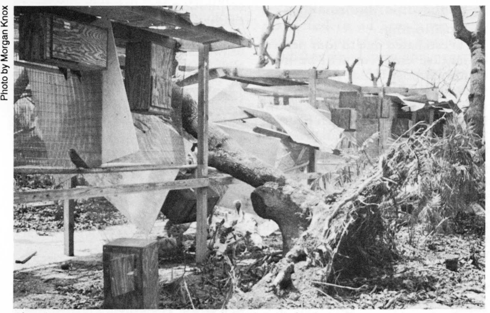
This photo shows the same general area of Luv Them Birds after Andrew went through. All shade is gone and much of the aviary sections are destroyed.