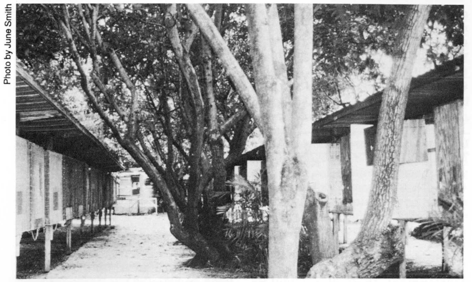
This photo shows the neat, tidy rows of breeding cages set up under big shade trees at Luv Them Birds, Inc., Goulds, Florida in early August of this year.