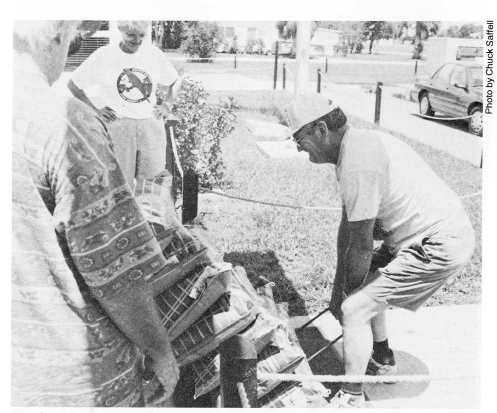
Brandon Avian Society members prove they can move mountains. Dollie wheels and frame groan . . . and backs strain to off-load 7,000 lbs. of donated seed to storage. It will soon be on-loaded again to another truck making the run into the disaster area.