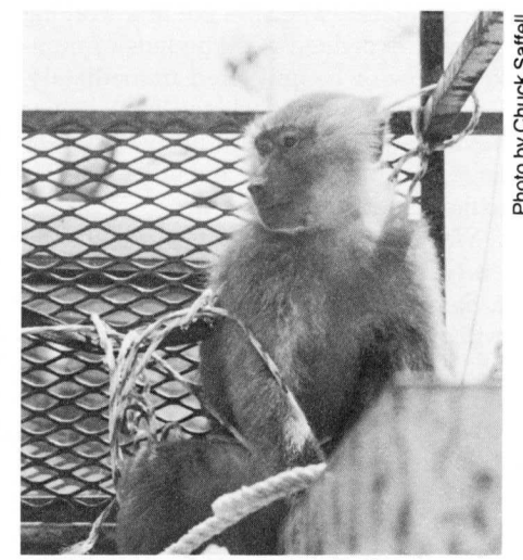
This forlorn tame and handsome baboon was found wet, scared and hungry. Here he's tethered to the back end of a truck bed until proper facilities can be found.

Our experience in the Goulds area was that if somebody did not need help, they