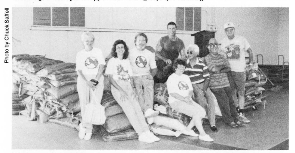
Members of the Brandon Avian Society take a break after they off-loaded 7,000 lbs. of bird seed for safe storage and re-distribution at the National Guard Armory, Palmetto.