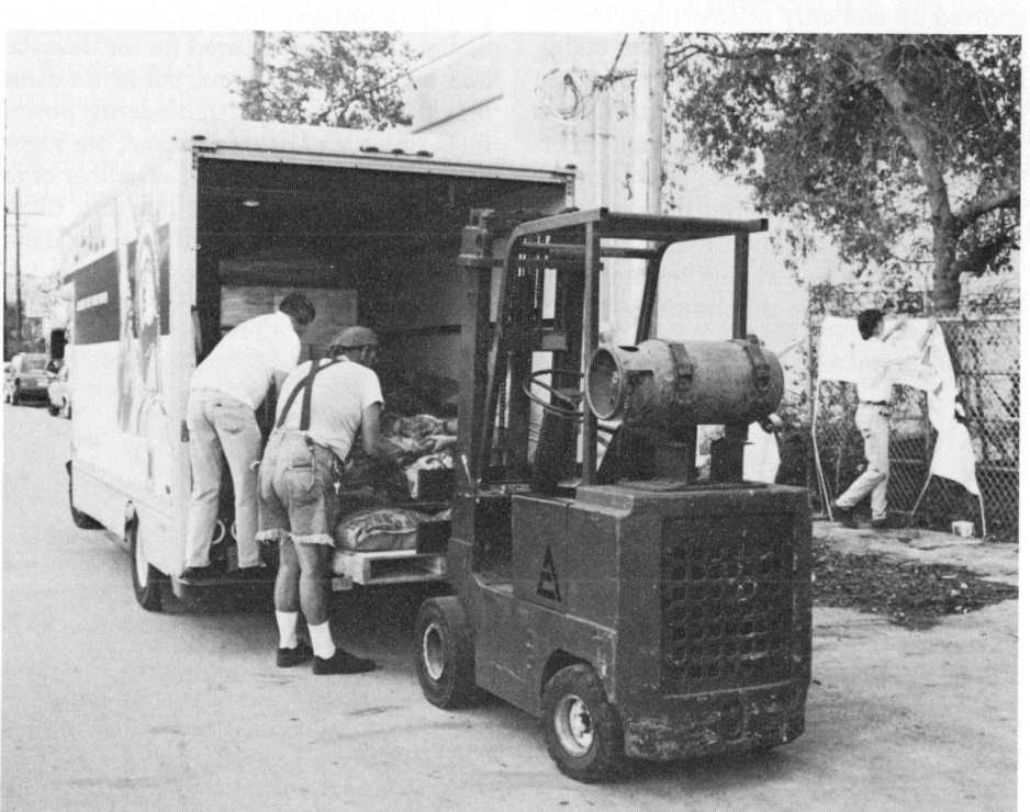
A fully loaded, rented truck makes a delivery to the AFA SOFAR distribution center in Dade County. Local bird club volunteer starts attaching the AFA/SOFAR banner to the fence.

We had heard numerous conflicting reports about these birds, and felt that first hand observation was the only way to evaluate the situation. The birds were found to be in pretty good shape. A local veterinarian had already stopped by and removed the injured and sick birds. A second vet had come in a day later and