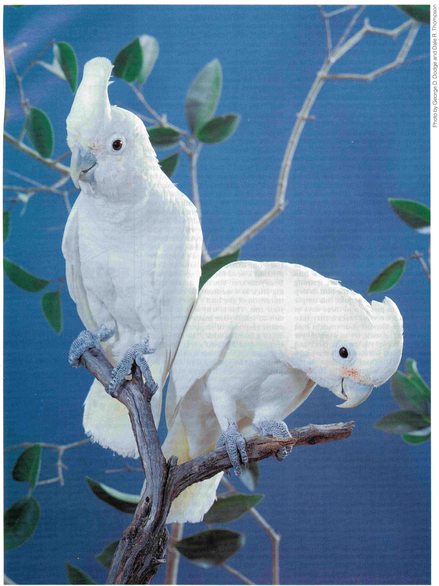
Adult Goffin's cockatoos