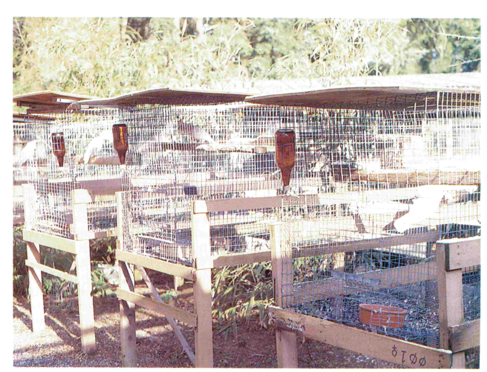
The author's cockatoo breeding cages, 3' \times 3' \times 6' , are elevated three feet off the ground.