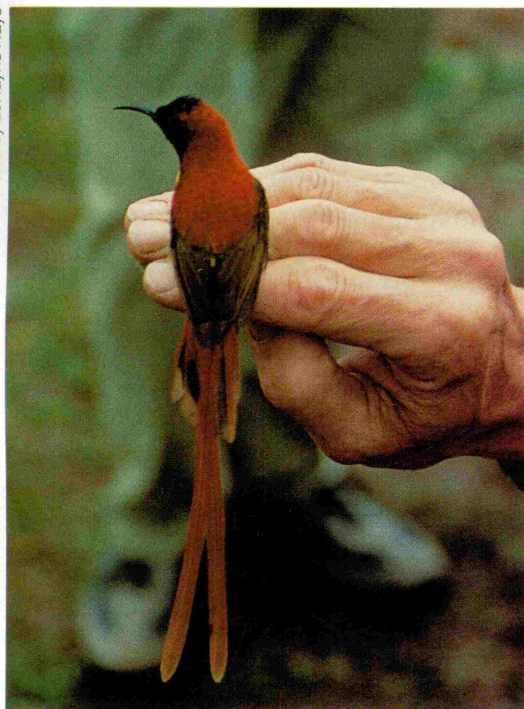
Back view of male firetail sunbird.

on it pours heavily until late afternoon. The terrain, being steep and roughly covered with dense brush and foliage, makes a visual census impossible.