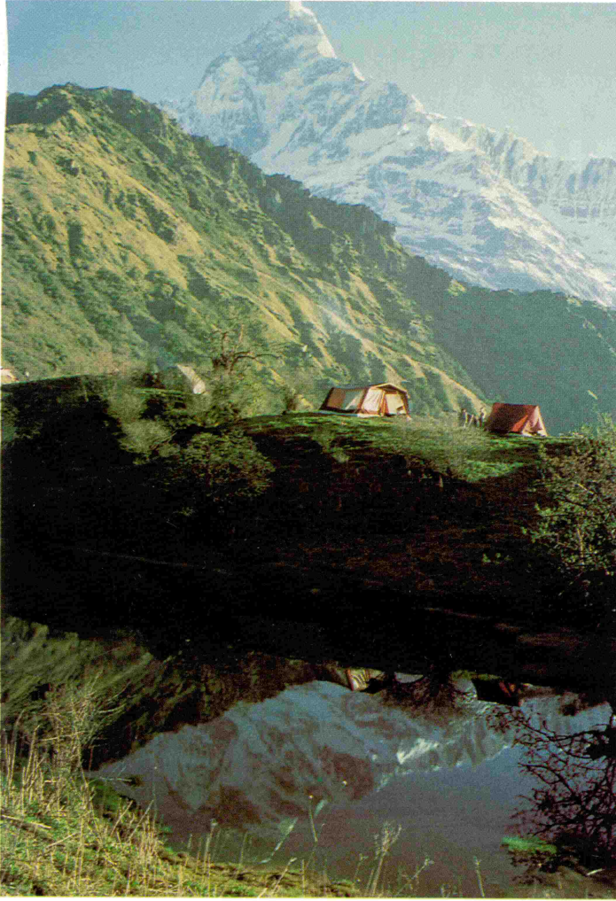
Camp site at Pipar, Pipar Holy Lake in foreground, Machupachure Mountain in background.