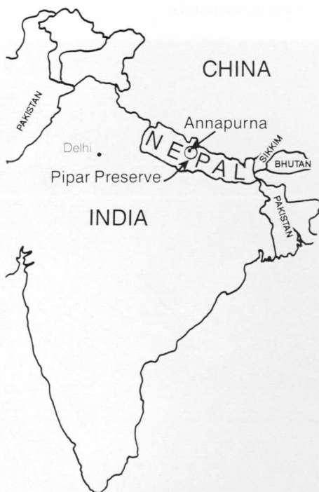
Pipar Preserve (10,000 foot elevation) lies near the Annapurna Mountain range in central Nepal.

We used the same census points that had been established by Tony Lelliot in the 1981 Pipar pheasant count. Armed with flashlights, A4 graph paper, pencils, a compass and wrist watches, we trudged over, under and through the incredibly inhospitable terrain to our census points. Once there, we