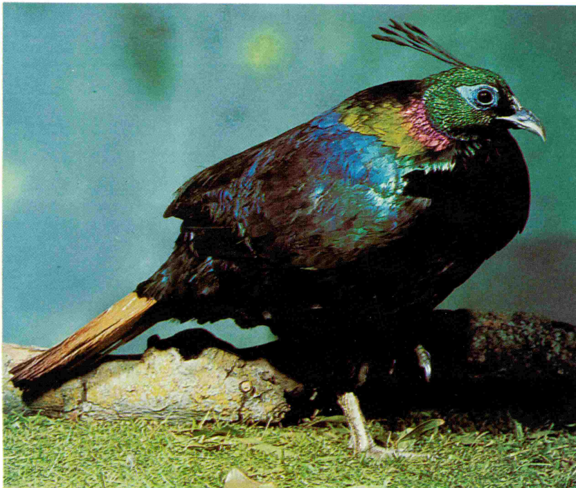
Impeyan (Himalayan monal) pheasant in captivity at the San Diego Zoo.

The early hour was necessary because the pheasants don't run on the same clocks as we do, and the only part of the day (if you could call 4 a.m. day) they call is between 4:30 to 5:30 a.m. The only time of the year they call is roughly the beginning to the middle of May, which happens to be pre-monsoon season. From mid-morning