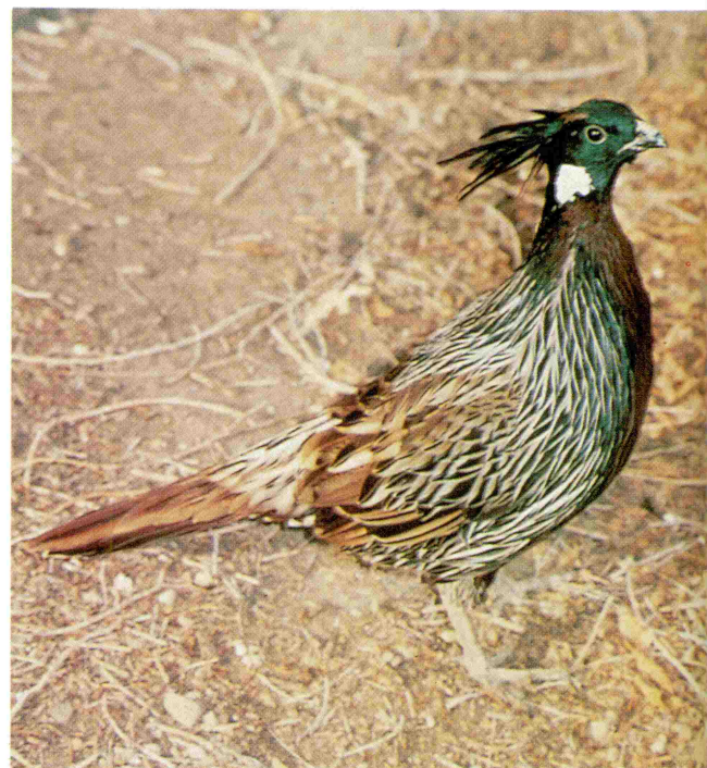
Koklass pheasant in captivity.