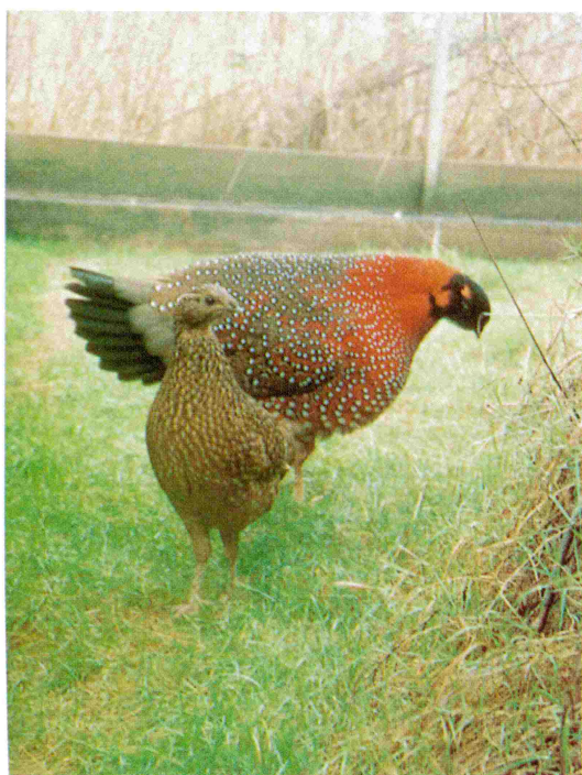
Pair of beautiful satyr tragopan pheasants.