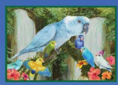
Blue Jungle Parrot facebook "LIKE" us & join us on FB

Birdhouse Publications sites.google.com/site/birdhousepub birdhousebooks@aol.com