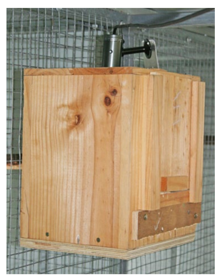
Nestbox used for Caiques with camera

The walkway is also a good place to store excess water/food bowls, a blackboard for record keeping and a range of other essentials. Many breeders utilise this area also to attach the nest boxes to the aviaries. This makes checking nest boxes far easier whilst breeding is taking place. At this point it is important to add that the majority of breeders leave their nest boxes up year round so as pairs can roost in their box both during the day and overnight.