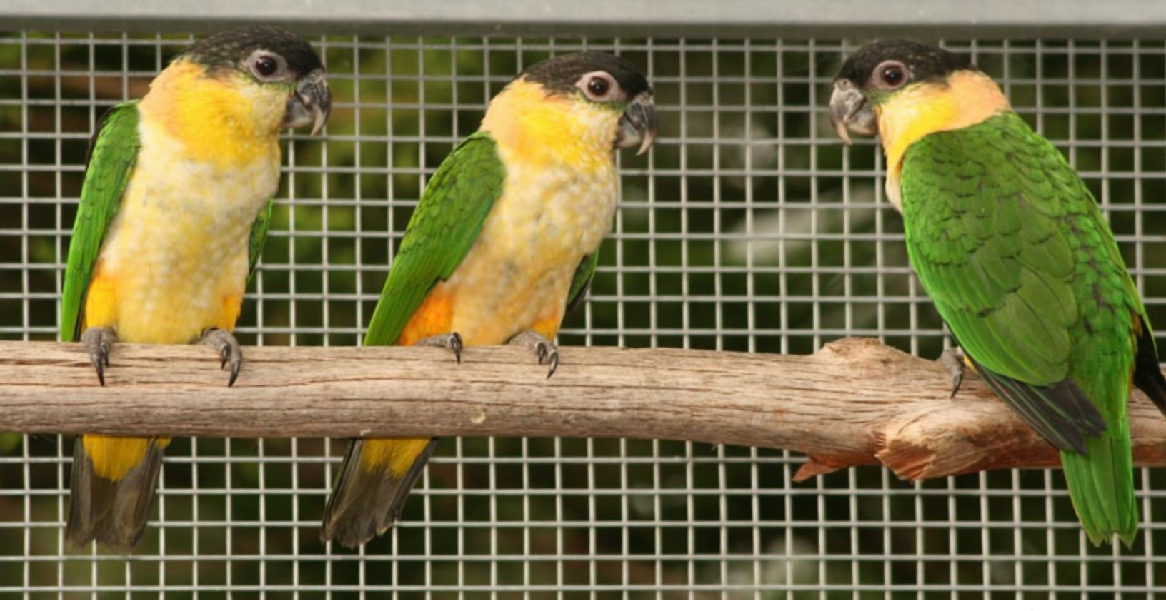
Parent reared Caiques

The Caiques (pronounced CAKE in the land down under) have long appealed to Australian aviculturalist's and many tell of their desire to keep this species having arisen after seeing them in Parrot reference books many years ago. Their appeal lies in their overall charm, which includes their inquisitive and playing nature and beautifully adorned plumage. It is safe to say that they are widely referred to as clowns for their habit of bounding about the aviary and putting on a range of displays.