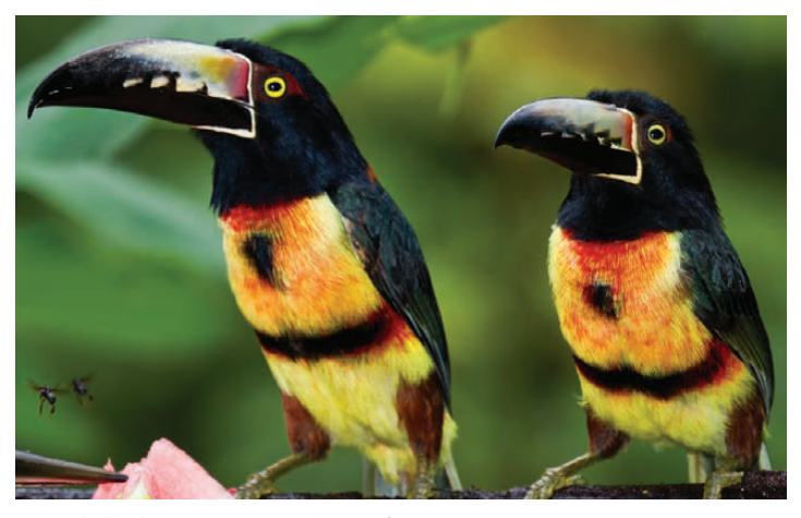
Fiery-billed Aracari (Pteroglossus frantzii)

we stumbled upon a large troupe of White-throated Capuchin monkeys (Cebus capucinus) enjoying their daily siesta. However, we quickly learned that despite their size and affable appearance, these creatures are fiercely territorial, and so we admired them, but from a distance. The diversity of birds seen here was extensive, and we were able to add to our already impressive bird species list such notable birds as the King Vulture (Sarcoramphus papa), Mealy Amazon parrot (Amazona farinosa), Red-lored Amazon parrot (Amazona autumnalis), Common Potoo (Nyctibius griseus), Violaceous Trogon (Trogon violaceus), Slaty-tailed Trogon (Trogon massena) and the Fiery-billed Aracari (Pteroglossus frantzii).