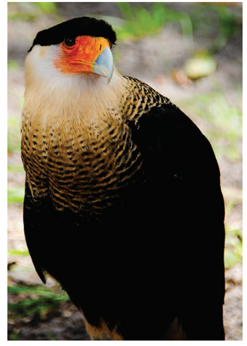
Northern Crested Caracara (Caracara cheriway)

by watching an indescribably beautiful sunset from a hilltop lookout that encompassed nearly 360° view both land and sea. At the Ensenada Lodge, Turquoisebrowed Motmots (Eumomota superciliosa) seemed to follow everywhere, and we became acquainted with a very friendly White-throated Magpie-Jay