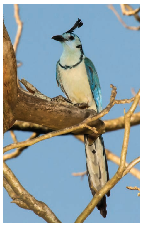
White-throated Magpie-Jay (Calocitta formosa)

(Calocitta formosa) sat with us every day at breakfast and lunch waiting for a handout. The deep, throaty howls of Mantled Howler monkeys (Alouatta palliata) residing in the trees around our accommodations accompanied the a.m. sunrise every day and almost made the local crowing roosters pale in comparison.