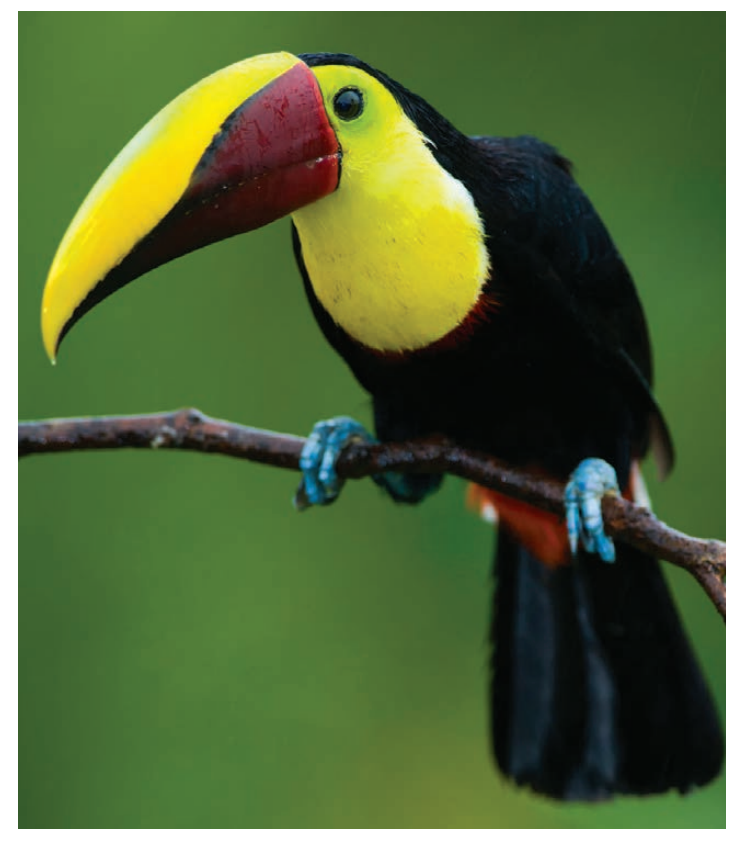
Chestnut-mandible Toucan (Ramphastos ambiguus swainsonii)

students responded by saying "color!" However, we learned that in actuality, the worst way to differentiate between avian species is by this characteristic. Contrary to popular beliefs and practices, spotting birds based on size, wing span, beak shape, and flight pattern actually prove more helpful than trying to identify them by their color first. So in addition to learning how to use the high definition video cameras, spotting scopes, and digital SLRs provided to us by the University, Monteverde also introduced us to this new and more effective manner of bird watching.