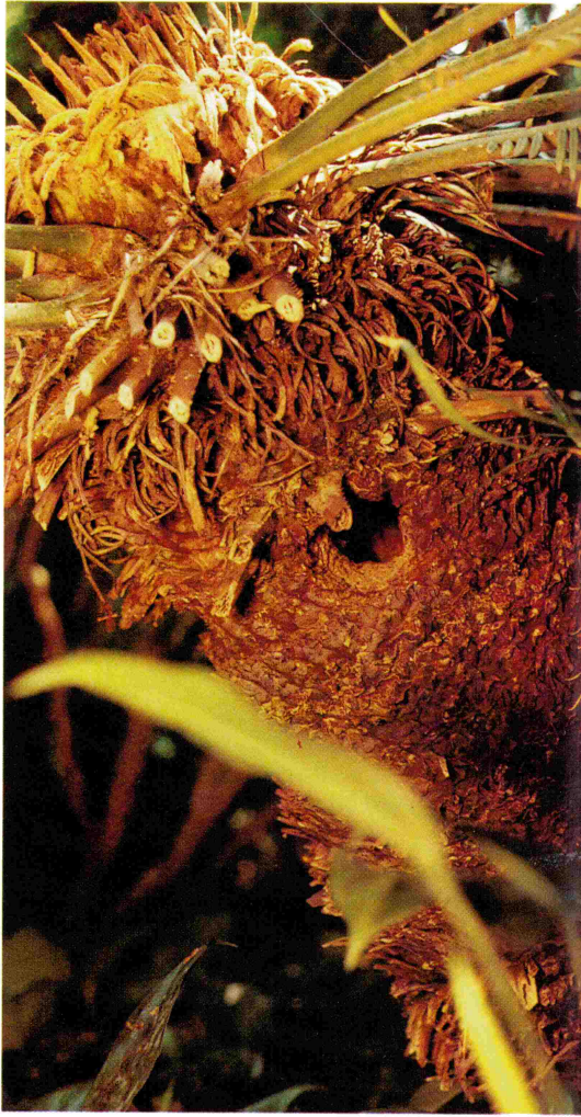
Pied barbet nest cavity in sago palm.