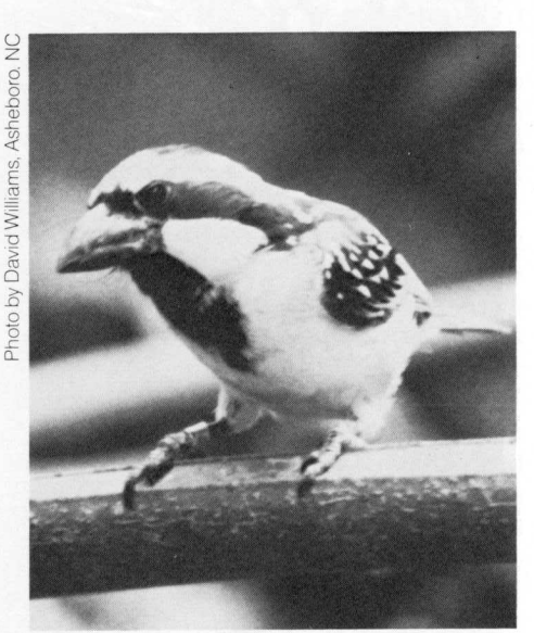
Adult pied barbet

and, after a few months, began to show interest in nestboxes. They would take up residence in a box, visiting, and inspecting it frequently, and often roosting in it during the day, only to abandon it after a few days.