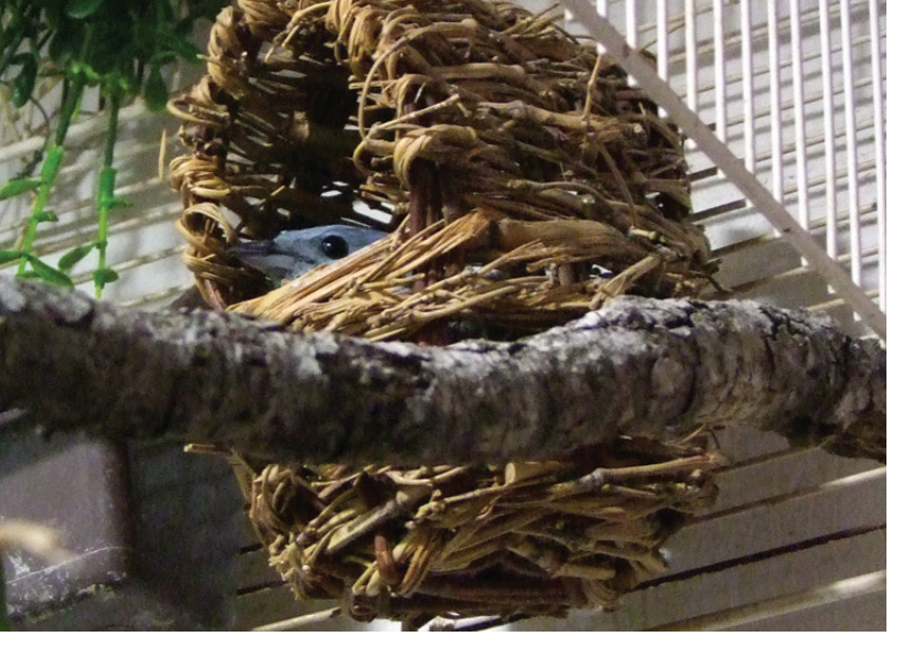
The Blue-grey tanager hen incubating her egg with a watchful eye.

sliced up. The pair would completely consume the pinkie mice but left the head and tails of fuzzies. Chopped chicken hearts and liver were gobbled up. The chicks fledged in about 15 days.