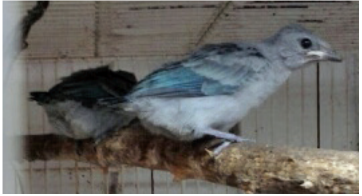
Blue-grey tanager Fledgling.

Food bowl with fresh fruit, greens and proteins.