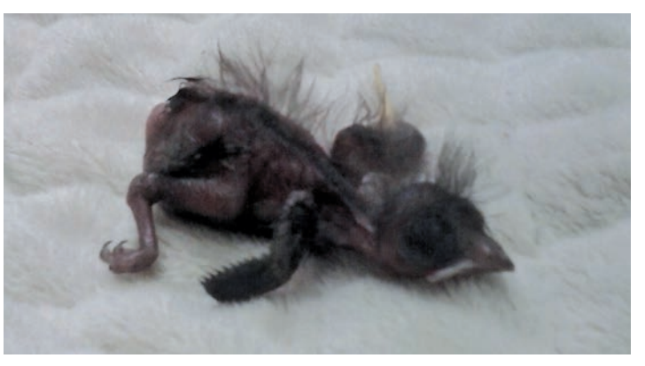
Young Blue-grey tanager hatchling.