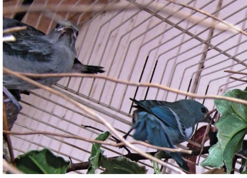
Blue-grey tanager in planted aviary.

I have immensely enjoyed these birds. I think they will be more beautiful in the natural sun. I will be moving them outside to the garden flights this summer, allowing them to enjoy a more natural setting, although they were easily kept and reproduced young inside much smaller quarters. My hope is that these birds will be raised in greater numbers to enhance our knowledge of avian softbills.