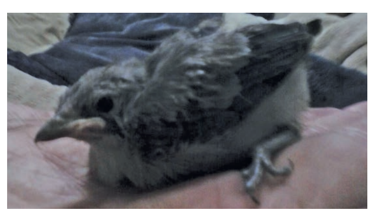
Juvenile Blue-grey tanager chick.