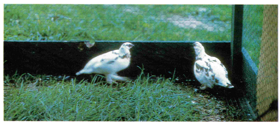
A pair of rock ptarmigan (approaching white winter color phase).

As you can see from the foregoing, when working with new and delicate species, it becomes very important to