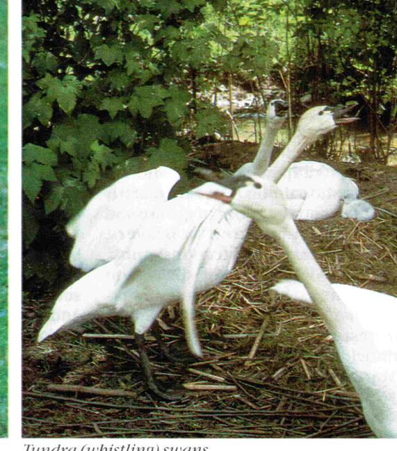
Tundra (whistling) swans.