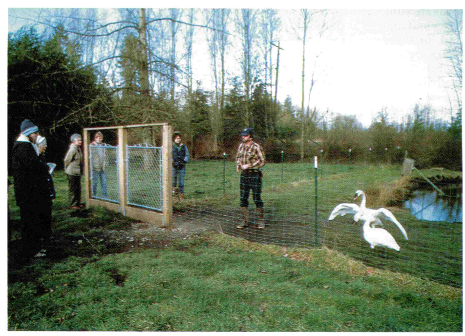
One of six annual nature tours at the farm.