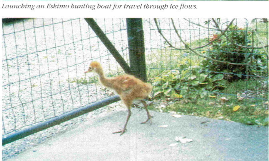
Baby sandbill crane.

laying eggs we allowed the males to compete and spar with each other at the fence. Once the first pair began incubation a four foot high visual barrier was installed between pairs. With their privacy assured, the reluctant pair immediately began nest building and as of the date of this writing have four healthy cygnets.