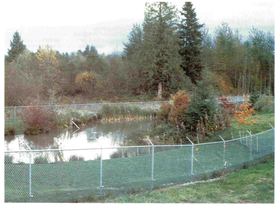
Predator-proof security fencing. Note electric fence wire eighteen inches above ground.