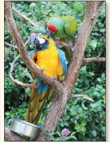
Top, a Solomon Island Eclectus at Sylvan Heights Wildfowl Park. Top right, a Victoria Crowned Pigeon rests on a ledge. Right, two Swainson's Toucans bask in the sunlight and Macaws play together, far right.