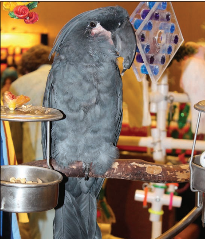
Major Mitchell's Cockatoo (top) and a Black Palm Cockatoo (above) look on as visitors at the 39th annual Convention browse through booths.

The first video clip captured the awful moment in which a highly skilled trainer was killed by an orca during the Orca's at SeaWorld show. Most of the attendees remembered seeing this clip in the news immediately following the horrifying accident. Some of the attendees actually knew the deceased trainer and other Orca experts who participated in additional interview footage that accompanied the 5 or so seconds shot during the ill-fated show itself. Nobody debates the tragedy at losing this young woman's