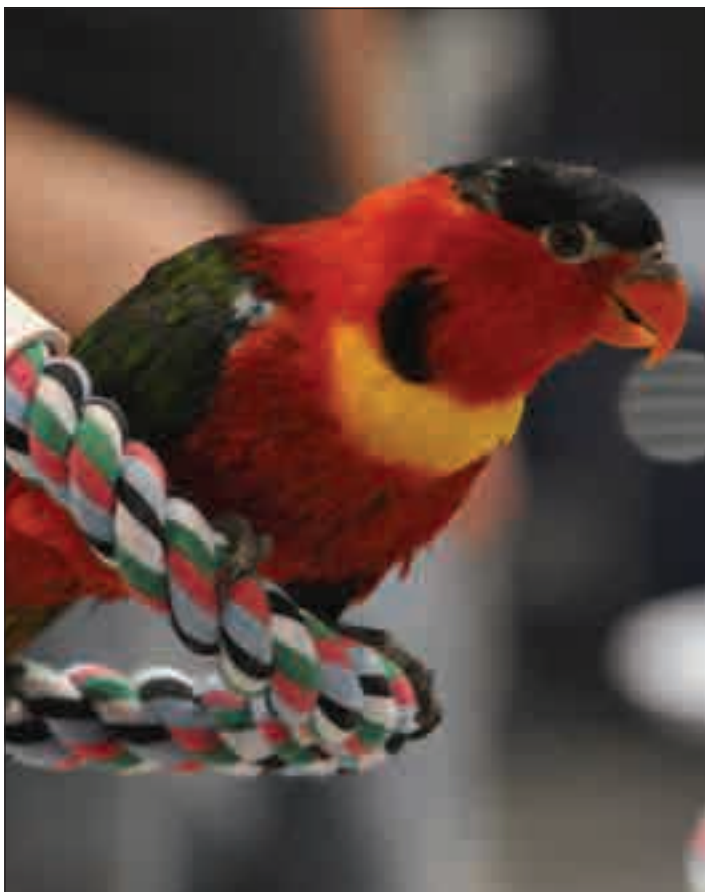
Yellow-bibbed Lory

This keeps the mess in the cage and the lory is less likely to paint the bars with nectar. Cover the wall behind the cage with something washable. Shower curtains work great. A desk mat under the cage makes clean up easy. My cages are 48" wide, 24" deep and 36" tall. The lories spend most of their time playing toward the top of the cage with toys and swings, and on the multi levels of perches, swings, or bungees. By keeping the food dishes at the lower level of the cage along with foot toys, they use all of the space. Misting the lory and the cage with water is something they love and makes wiping down the cage easier to clean.