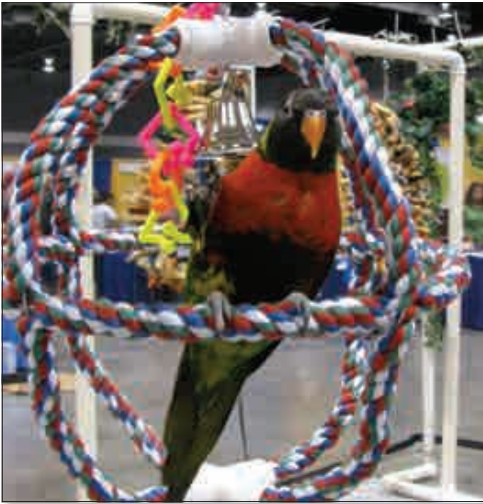
Forsten's Lorikeet