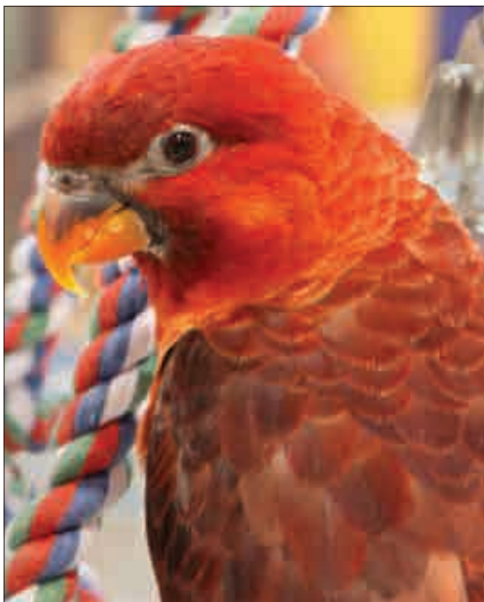
Cardinal Lory

to live with me. Pogo earned his name because of the way he hops up and down when he gets excited, or when he is in his travel carrier. Pogo is about 8 years old and is fairly tame, but does not like to be petted or scratched. He will perch on your hand or your arm for short periods of time or to go from place to place. He loves to take toys apart. It is a challenge he enjoys immensely. Yo-Yo is named for his similar trait of hopping up and down, and he calls a name that sounds like Yo-Yo. I guess he learned the hopping trait from watching his father. Yo-Yo is about three years old and very tame. He loves to go places with me and will hop right into a travel carrier but does not want to go back in his cage. He also loves to destroy toys of any kind. His Whiffle ball is his favorite toy, and he loves to dunk it in his water dish and then toss it across the cage.