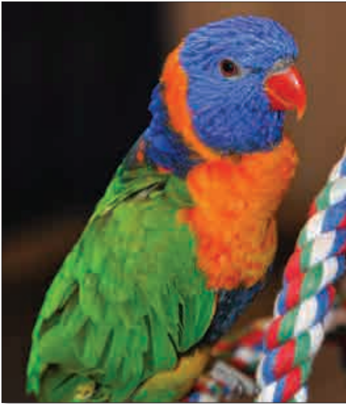
Red-collared Lorikeet