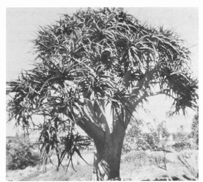
Aloe Bainesii 15 feet tall.

average gardener. If all you can find is a two inch liner, plant it anyway. The Aloe is a fast grower, and best of all, will do so without special care. For example, Aloe bainesii (the tree aloe) can be quite a formidable tree in less than ten years. Whether or not it was a cutting or a seedling, it grows fast.