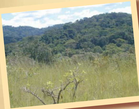
Good forest habitat for parrots in Cameroon.

Preliminary information on mortality indicates that an average of 16% die between capture and arrival at the traders, and that additional mortality prior to export can explode to as much as 80%. Most deaths result from poor handling and transportation difficulties. More precise figures will be gathered, including numbers of birds seeping through Cameroon's borders, so as to arrive at a realistic annual total of captures for each species. Capturing techniques vary across the country, but frequent techniques use nets and gummed sticks, both at roosting and feeding sites. Some of the techniques are very harmful. All sexes and ages are captured and no breeding season is observed by trappers. Exporters, in obtaining permits and other documents to export birds legally, complain that the cost of preparing parrots for export is relatively higher in Cameroon than other African countries, thereby placing them at a disadvantage in the world parrot market. This can lead to smuggling of birds to neighbouring countries, and one view is that this constitutes an economic loss to Cameroon. Smugglers of parrots are punished using the provisions of the 1994 Forestry and Wildlife Law, and seized parrots are either sent to the Mvog-Betsi zoo in the city of Yaounde, or publicly auctioned either to legal exporters, or to the general public. In the city of Douala (Littoral Province) as an example, the number of parrots apprehended per month has ranged from 3 to 480.