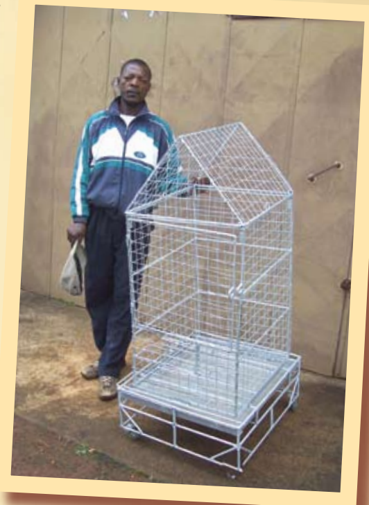
A parrot seller, and a cage on offer to buyers.

Trappers usually prepare cages or rooms in their houses to hold the birds, and during months when there are no customers coming to the house they smuggle the birds to urban areas or sell them along major highways.