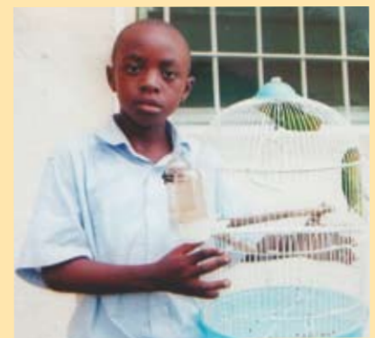
Two red-faced Lovebirds being kept as pets.

munities might leave native forest standing instead of cutting it down; and one important aspect of the project is to assess the extent to which the harvesting of parrots provides sufficient value for a community to leave the forest intact. The foremost aim of the project is to appraise the value of consumptive use of native parrots in the form of sustainable trade; but eventually it will also need to compare the value from a non-consumptive use such as Eco-tourism. The project will also not