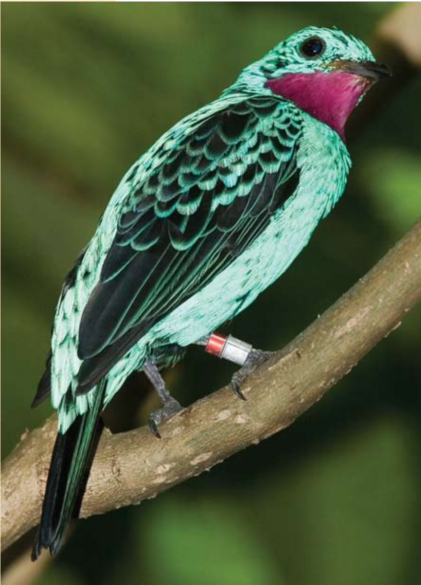
Male Spangled Cotinga.

The female was reintroduced to its exhibit in early February 2002. Although the male began displaying at once (flying back and forth between high perches), the first egg was not laid until 30 May, hatching 14 June. This chick fledged 12 July, and at seven months of age was paired with a San Diego hatched male, off-exhibit in Milwaukee. An egg laid 8 August was broken the same day. At this point the chick hatched in June was removed. Another egg was laid 28 August, hatching 11 September 2002. That chick was still present when the fourth 2002 egg was laid 24 October, and when it hatched 15 November, producing a chick which lived only six days. In late November the "howdy cage" (where all eggs were laid) was closed until February 2003, and all other nest baskets removed, but the breeding pair was allowed to remain together (with more than one food station provided) (Couch et al. 2003). (Kim Smith informed me the female constantly chased the male from food stations and kept it away from fledged chicks. On the other hand, the male appeared to guard the nest site, located at a height in the aviary that it did not normally frequent.) No eggs were laid in 2003. It was later concluded this was due to a female chick held off-exhibit, but within view of its female parent (Kim Smith, pers.com.).