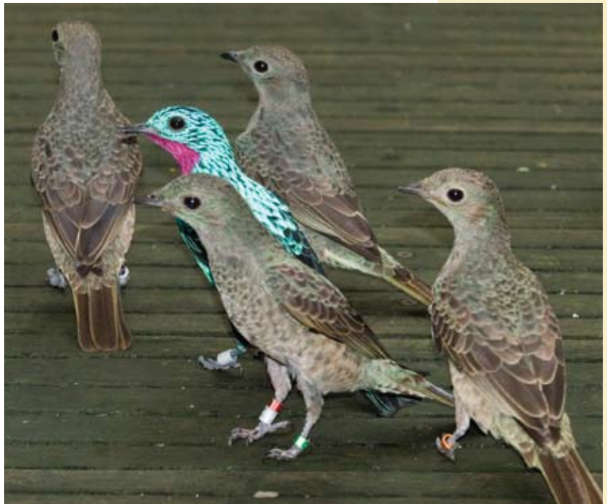
Spangled Cotingas.