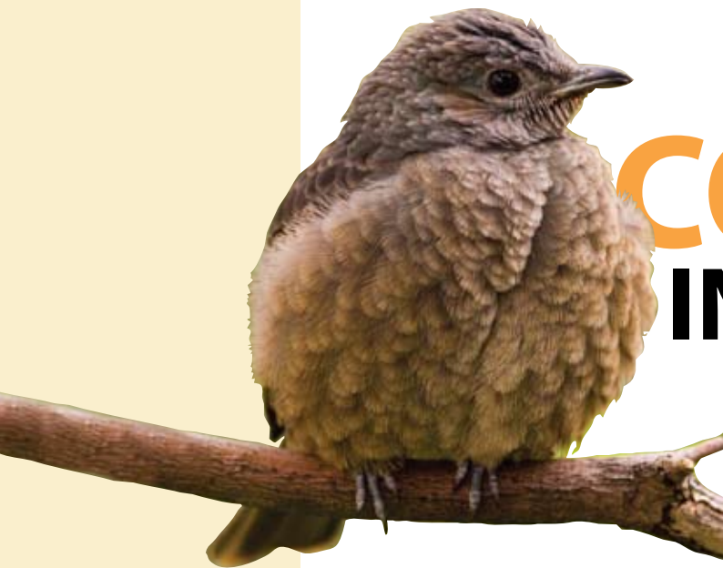
Female Spangled Cotinga ( Cotinga cayana )