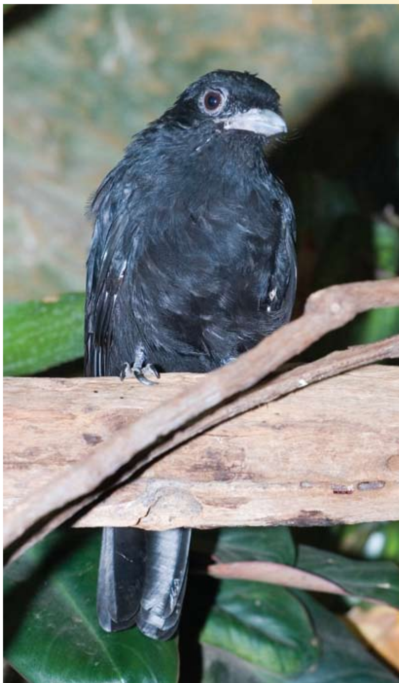
Purple-throated Fruit Crow.

That said, it is to be hoped that American specialists in softbills will avail themselves of the opportunity to work with this species, a bird that has so far proved the most prolific cotinga in aviculture, with offspring produced in ten collections since 1991.