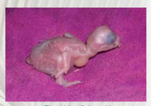
The chick at 7 days old