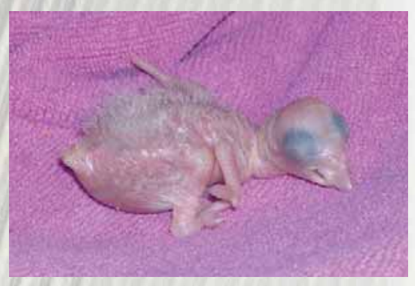
This is the first Blue-cheeked Amazon that hatched in the United States. This photograph was taken when the chick was one day old

Eventually, in late 2005, some breeding cages adequate for amazons were available and two pairs of Blue-cheeked Amazons were moved to these cages. Pairs were chosen at random with out any regard to behavior, color or temperament. The winter of 2005