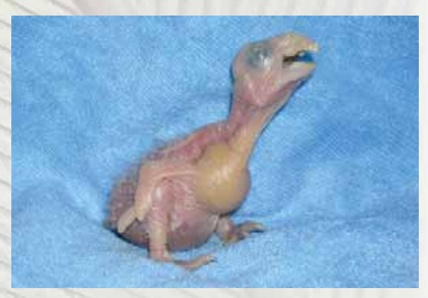
2 weeks old