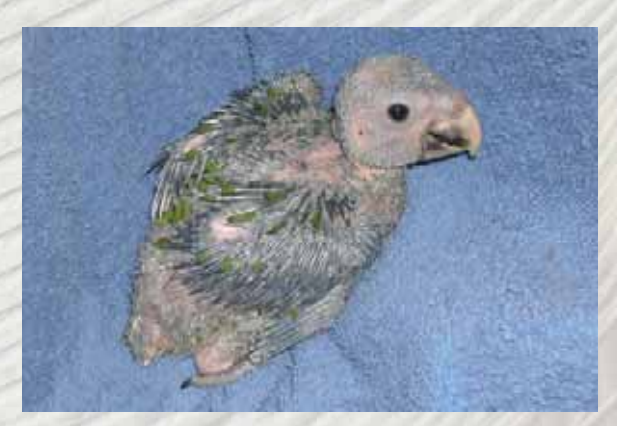
35 days old