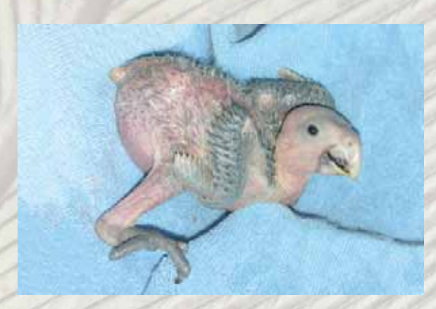
4 weeks old