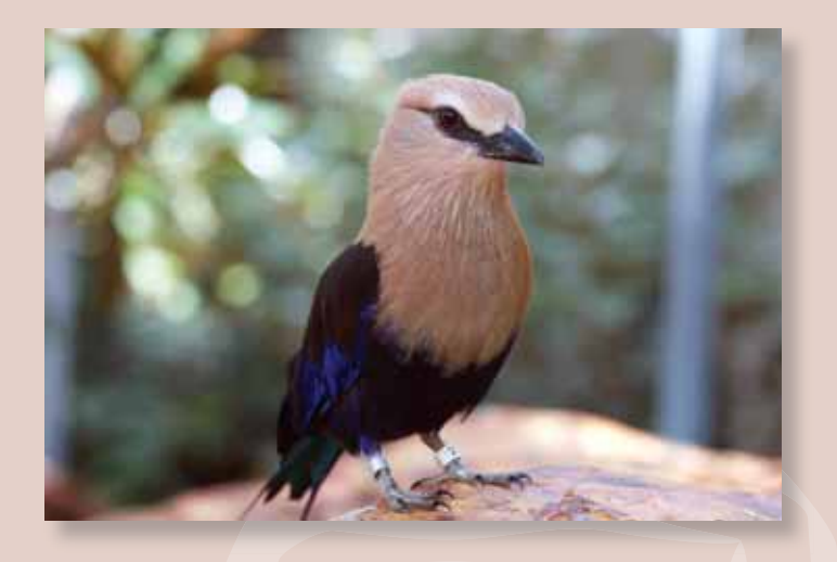
Blue-bellied Roller