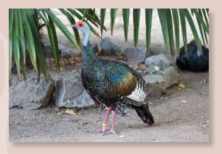
The Ocellated Turkey is uncommon in the U.S. The Dallas Zoo has been very successful breeding this species the last few years and has been able to supply other zoos with these birds.