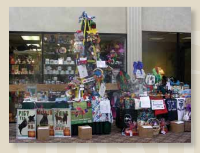
A view of some of the State Baskets spread out next to AFA Raffle Table. The Texas State Basket (middle) was again the winning basket in the State Basket competition.