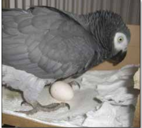
Pictured left is the rejected fake egg. Toby is incubating and rolling her new egg.

chickens. But that only confused the situation because people believe all chickens live with a rooster!