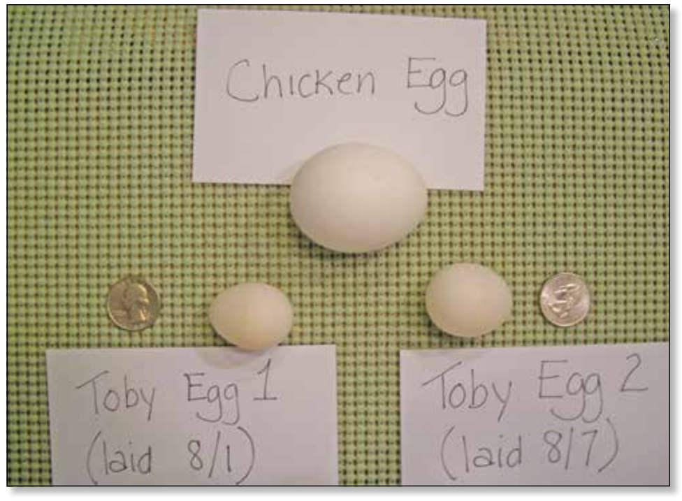
A chicken egg, in comparison to Toby's two laid eggs

Toby then arrived in New Jersey, to a house with two Jenday conures, a Senegal parrot and one, rescued, long-haired