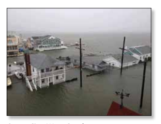
Ocean City, NJ on October 29, 2012

affect parrots and parrot owners on Long Island for some time. Initial evacuations displaced the largest number of parrots and their owners for a relatively short period of time. Many of these were able to return to their homes in time to be radically affected by the subsequent