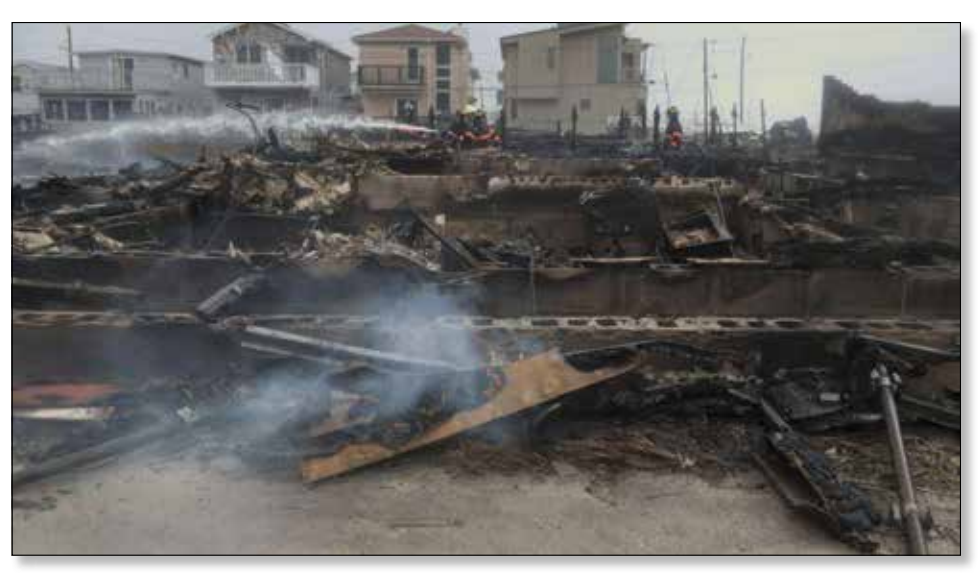
Breezy Point, NYC

Going into springtime we expect a third round of displacements, due to reconstruction and renovation projects that were impractical in colder months. These are somewhat less likely to affect parrot owners, but important for the