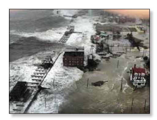
Atlantic City, NJ

What I saw in my community was heartbreaking. What I observed my clients and the bird community do was simply, amazing. Afterwards, as our clients arrived at our shop, The Platinum