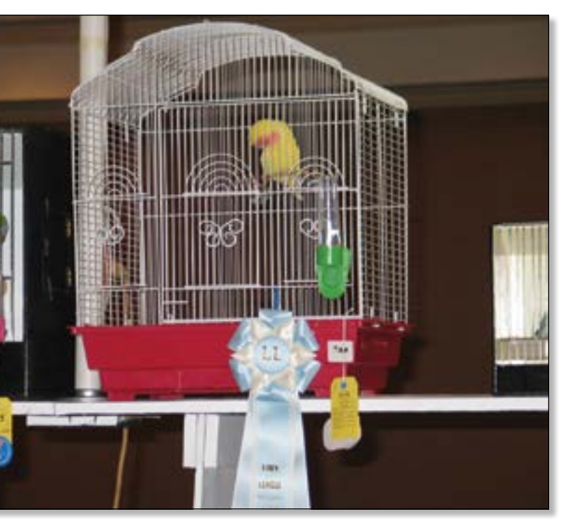
Fifth Best in Show Quaker Parakeet (left) and Sixth Best in Show Lutino Peachface Lovebird.