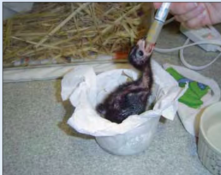
A 9-day-old chick is fed in his cup.