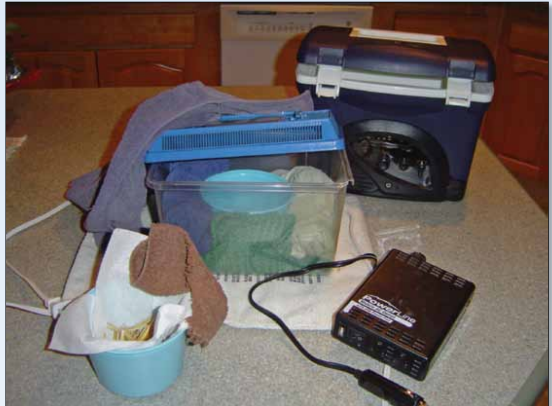
The mobile setup includes a heating pad, power inverter, brooder, chick's cup and an ice chest.

My problem, though, is that handraising while working full-time out of the house is a big chore. Being able to be mobile while successfully