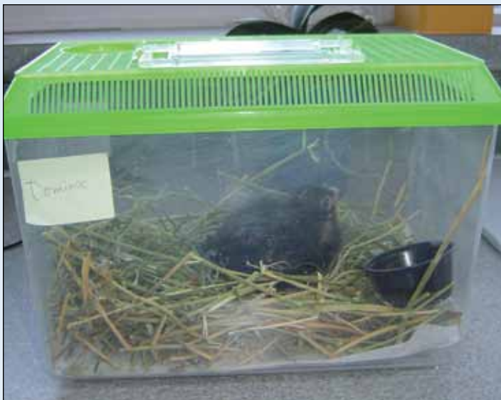
Weaning a White-cheekedTuraco, in his carrier with a feed cup.

right side of the turaco's neck after feeding. Healthy turacos will gape hungrily, even when the food is visible in the throat, and, if overfed, can aspirate easily. Once home at about 7 p.m., I feed every hour until 11 p.m.. I do not feed through the night.