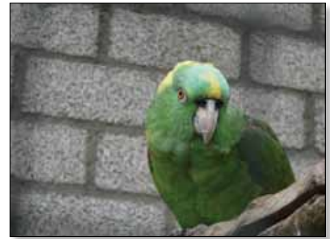
One of the Roatan Yellow-naped Amazons ( Amazona auropalliata caribae )

victoria), Sheepmaker's ( Goura sheepmakeri sclateri ) and Blue-crowned Pigeon ( Goura cristata ), the numerous Sun Bitterns ( Eurypyga helias helias ) and the flock of Carmine Bee-eaters ( Merops nubicus ). Near the little ponds, we often find the beautiful Egyptian Plovers ( Pluvianus aegyptius ), which are getting rarer in European bird collections, along with a pair of Wattled Jacanas ( Jacana jacana ).