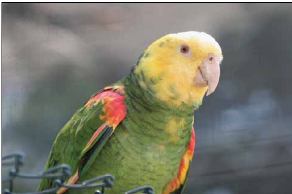
One of the rarely seen Magna Yellow-headed Amazons ( Amazona oratrix magna )

Magna Yellow-headed Amazon ( Amazona oratrix magna ) sometimes considered as a color mutation of the nominal subspecies of Yellow-headed Amazon, a pair of Black-crowned Cranes ( Balearica pavonina pavonina ) and a pair of the beautiful Swinhoe's Pheasants ( Lophura swinhoii ). During my last visit, in 2009, this exhibit was being renovated and more rare