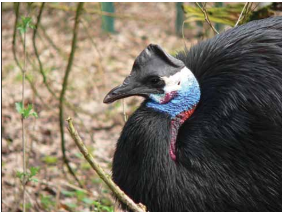
One of the three specimens of Bennett's Cassowaries, a member of the subspecies Casuaris bennetti papuanus

or confiscated turtles, including endangered species such as African Spurred Tortoise ( Centrochelys sulcata ) or Madagascar Star Tortoise ( Astrochelys radiata ), to name a few.