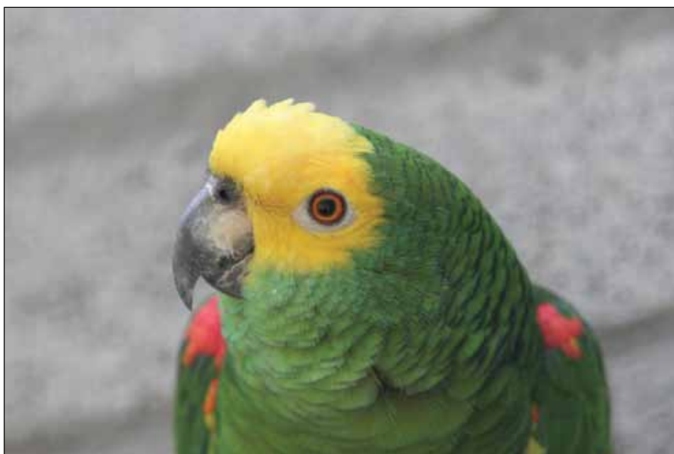
At top is one of the Baudin's Black Cockatoos ( Calyptorhynchus baudinii ). Above is one of the very rare Marajo Yellow-fronted Amazons ( Amazona ochrocephala xantholaema ).

( Amazona vinacea ), Green-cheeked Amazons ( Amazona viridigenalis ), Lilacine Amazons ( Amazona autumnalis lilacina ), Blue-cheeked Amazons ( Amazona dufresniana ), Cuban Amazons ( Amazona leucocephala leucocephala ), Red-lore Amazons ( Amazona autumnalis autumnalis ), the very rare Yellow-bellied Amazons ( Amazona xanthops ), Yellow-shouldered Amazons ( Amazona barbadensis barbadensis ), the rare