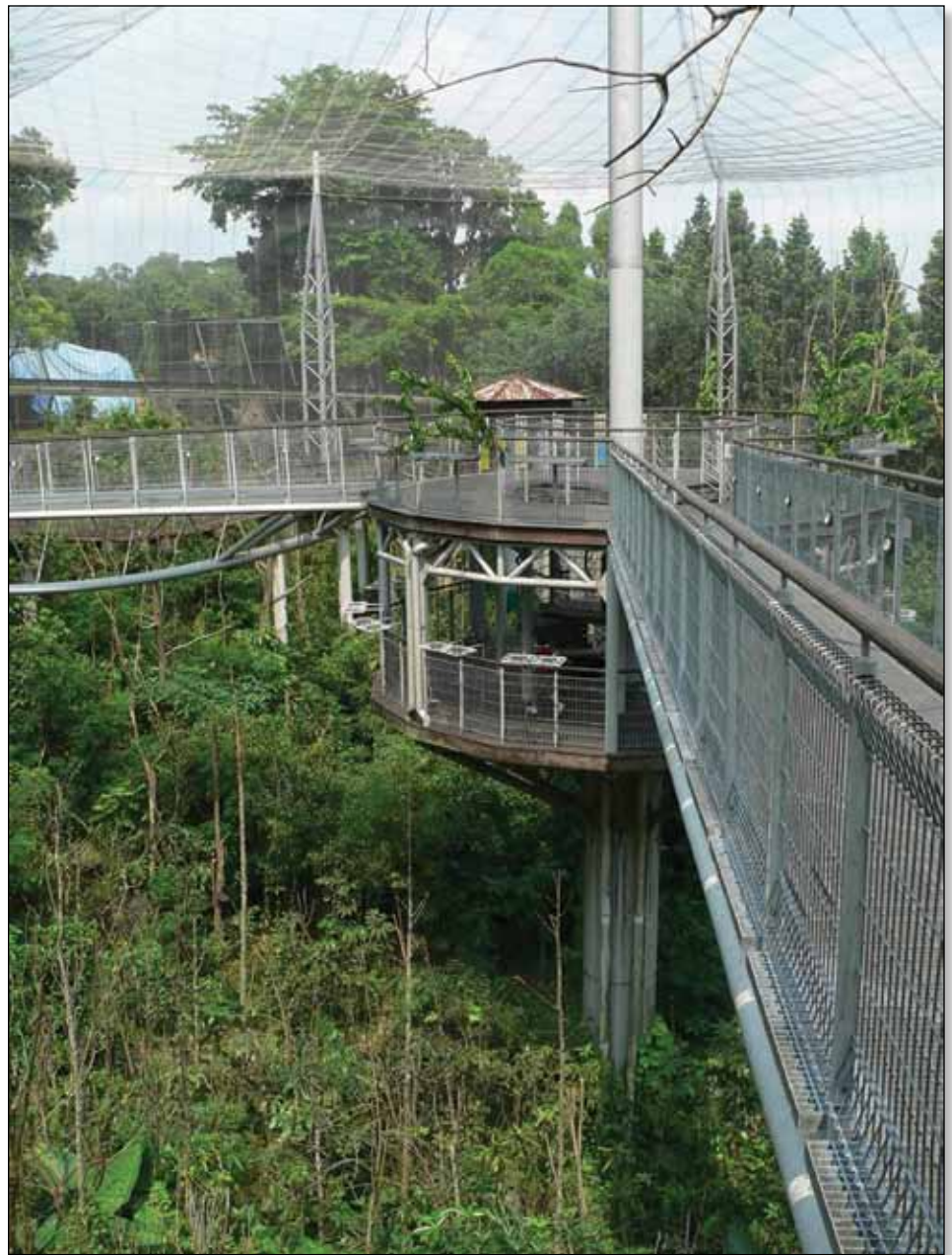
An interior aviary lookout and feeding platform

I was first introduced to this unique bird park by a parrot breeder friend who took me there and offered me a guided tour of the facilities in April 2006. I had already visited many nice bird collections