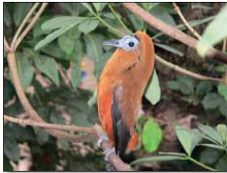
A highlight of the exhibit of free-flying birds, a Capuchinbird ( Perissocephalus tricolor )