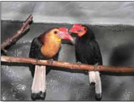
A pair of Wreathed Hornbills ( Aceros leucocephalus )