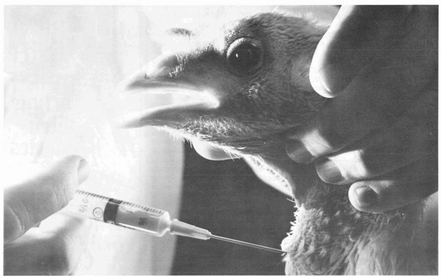
An ornithosis bacterin (an inactivated bacterial product used for immunization purposes) is administered to turkeys by intratracheal inoculation (actual angle of inoculation is differ-