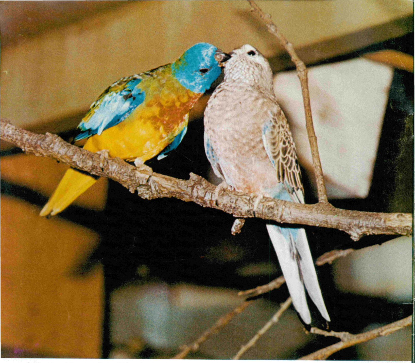
Scarlet Chested Parrakeet (Splendid Parrakeet) male on left, normal Bourke Parrakeet hen on the right. This most unusual pair has produced some interesting and beautiful results. See article on page 31.