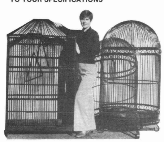
#235C 22" × 36" × 60

ALSO CUSTOM MADE CAGES TO YOUR SPECIFICATIONS