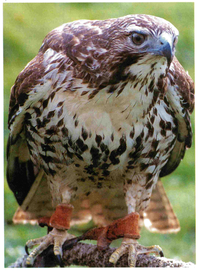
Tethered in Deuel's yard, this red-tailed hawk eyes the camera with suspicion.