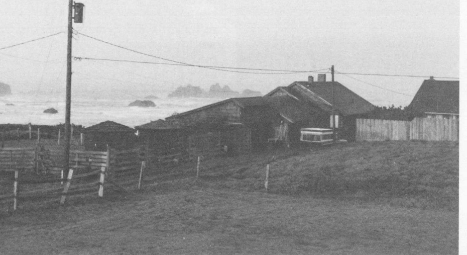
Free Flight looks out over a panoramic stretch of beach and ocean.