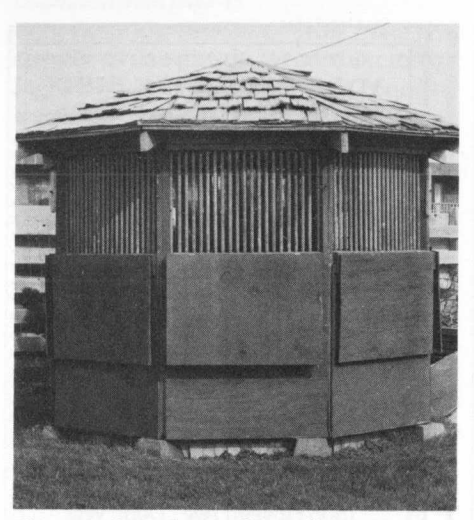
Close up shot of one of Deuel's mews.

with a desire to treat every injured bird he could find and would evolve into a staunch resolution to educate people to the Schweitzerian philosophy of "reverence for life."