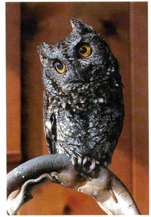
One of Dan's permanent residents, a screech owl blinded when it collided with a motor vehicle.