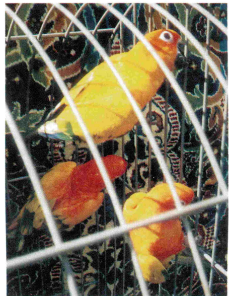
These year-old Sun Conures are being held back for breeding stock.

are double stacked with trays separating the upper unit from the bottom unit. Nest boxes alternate front to rear in each stack which causes all nest openings face either east or west. The nest boxes are made of wood but are lined with wire. Seven dust (5%) is powdered very lightly in the areas of the nest boxes but never when there are chicks present in a box. It is never placed inside a box. Between breeding seasons the nest boxes are taken down for inspection and repairs after which they are sprayed with an insecticide, disinfected and refilled with fresh nesting material.