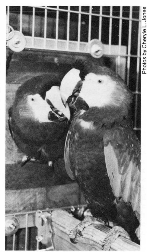
A mature, bonded pair at nest box.