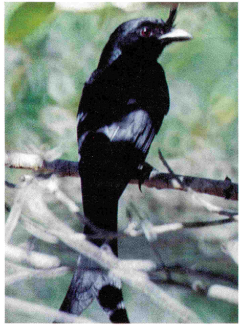
The Crested Drongo (Dicrurus forficatus) is a wide-ranging species that is found in each of Madagascar's different forests. It has adapted to living in some disturbed areas.