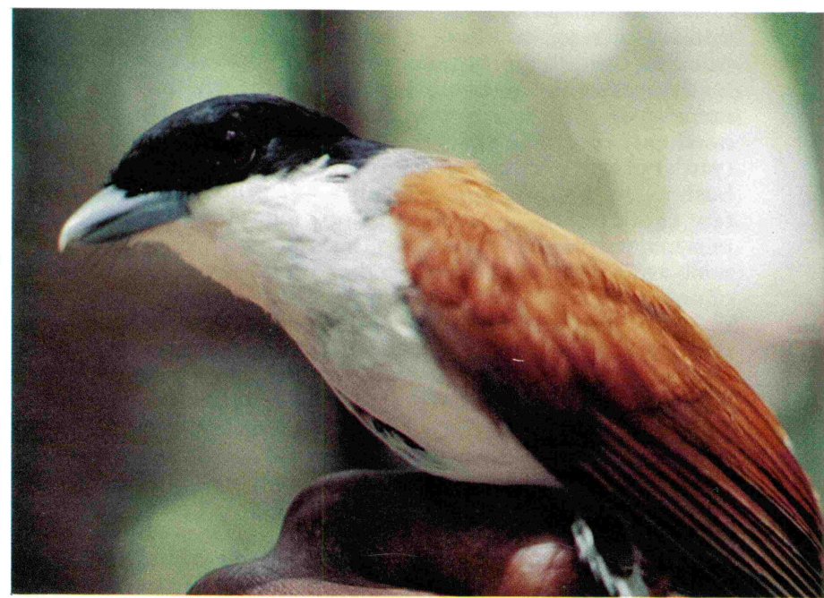
A female Rufous Vanga (Schetba rufa) incubates three eggs. This bird and her mate produce vocally complex duets in addition to making clacking and popping sounds with their bills.