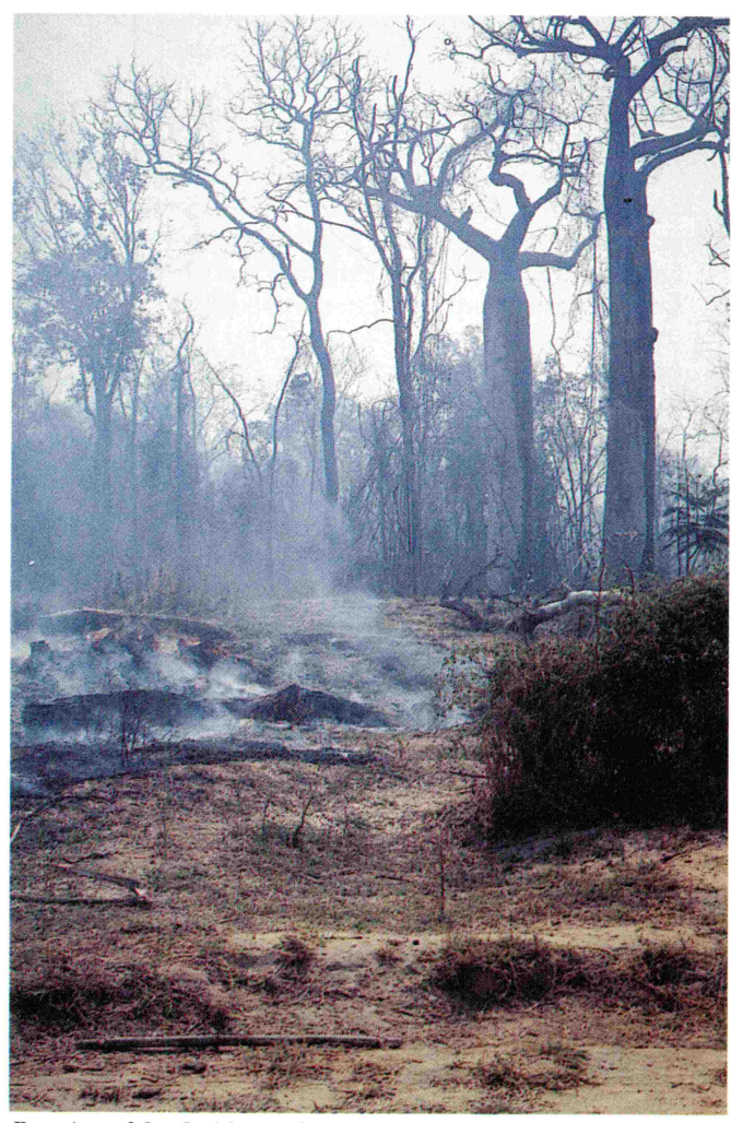
Burning of the deciduous forest to clear land for farming threatens the island's baobab trees (Adansonia spp.) as well as other plants and animals of western Madagascar.