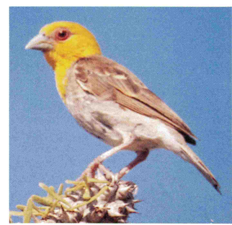
A male Sakalava Weaver (Ploceus sakalava). The males build their nests in colonies and display from their nests during construction to attract a mate. This bird is widespread in the dry western parts of Madagascar.