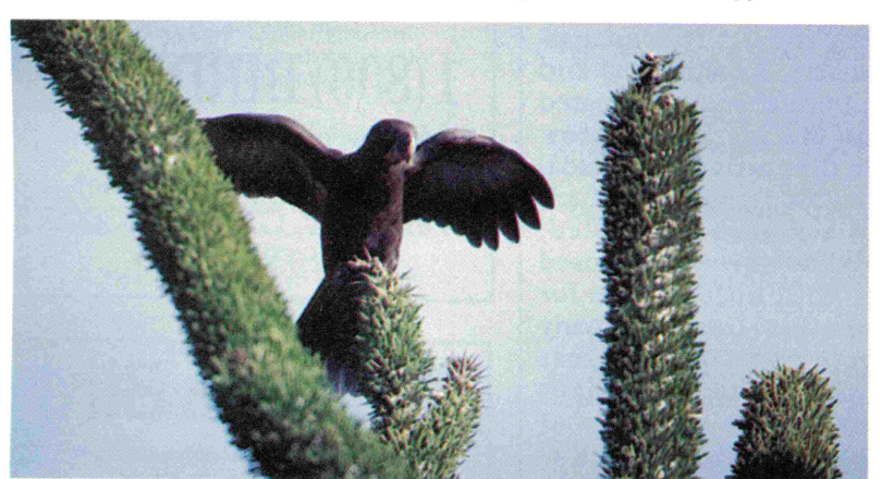
A Vasa Parrot (Coracopsis vasa) perches gingerly on a spiky Didierea tree in southwestern Madagascar. This bird and its flock members were eating the meristematic tips from this plant.