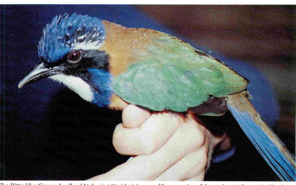
The Pitta-like Ground-roller (Atelonis pittoides) is one of four species of the endemic Ground-roller family that inhabit Madagascar's rain forests. A fifth species lives in the spiny subdesert of the southwest. All of these species lay their eggs at the end of tunnels they excavate in banks or the ground.