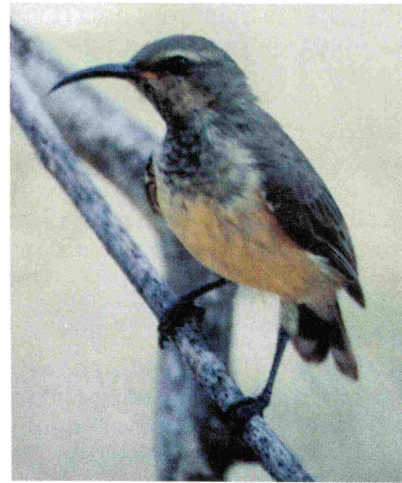
The Souimanga Sunbird (Nectarinia souimanga) occurs commonly throughout Madagascar, ranging from northeastern rain forest to the southwestern subdesert. This nectarfeeding bird pollinates many species of plants.