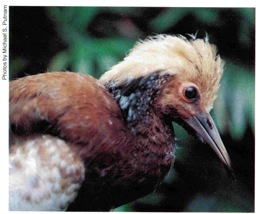
A recently fledged Madagascar Crested Ibis (Lophotibis cristata). As an adult, the facial skin of this forest-dweller will become bright red and devoid of feathers.