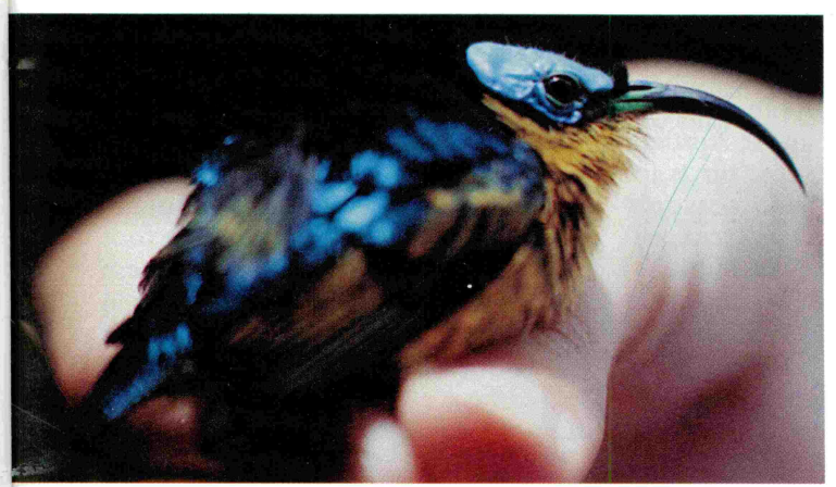
This male Sunbird-asity (Neodrepanis coruscans) is only very distantly related to the true sunbirds. The fleshy facial wattles greatly expand in the breeding season and nearly touch at the top of the head.