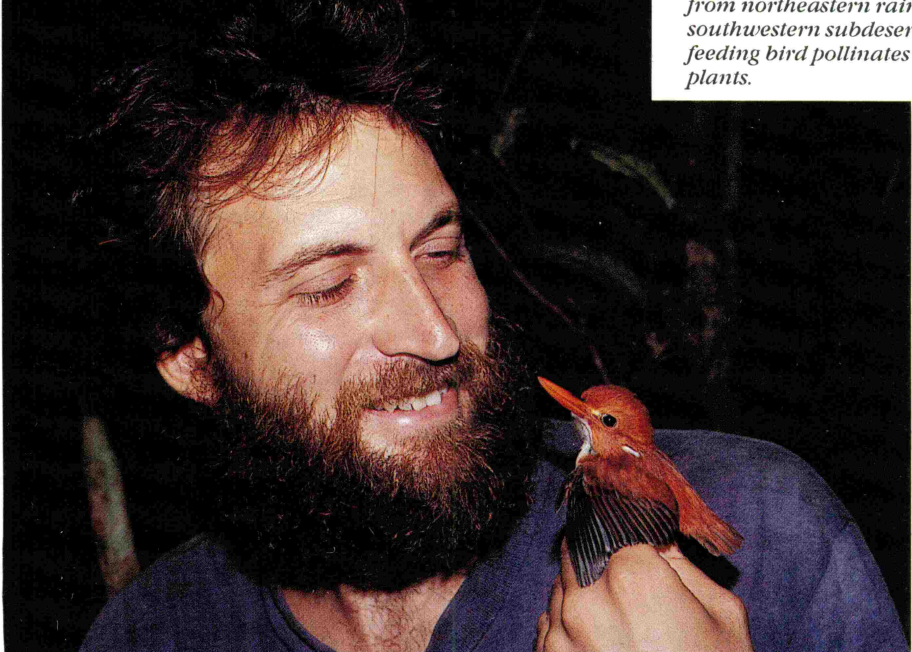
The author with a forest-dwelling Madagascar Pygmy Kingfisher (Ispidina madagascariensis) that was caught with a mist-net on the Masoala Peninsula.