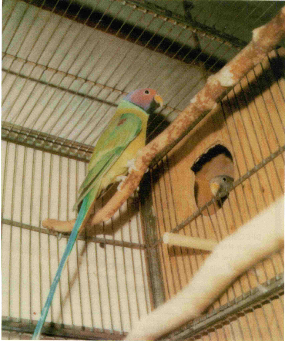
This breeding pair of plumbeads finally felt comfortable enough to get down to business. They wanted their privacy and preferred a high, far corner.

A mixed basket of eight babies — Christopher, approximately 4½ weeks old, in back at right, surrounded by Abyssinian and peach faced lovebirds.