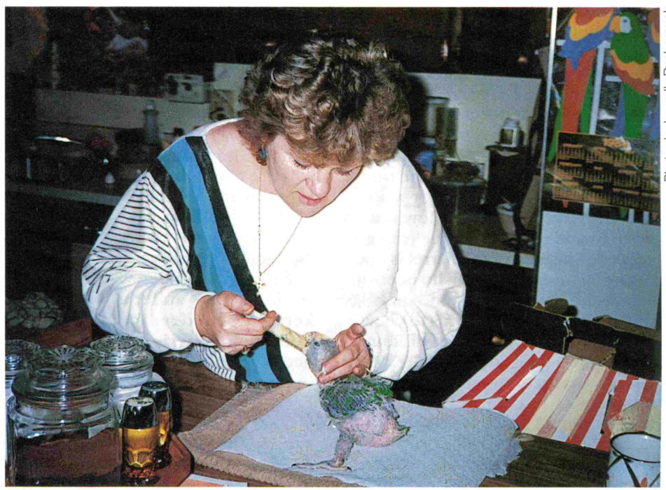
Feeding time will be followed by clean-up time for this hand fed youngster.

Since the flights are located inside a building, if an occasional bird escapes from the flight, it will not be lost. Her breeding pairs are set up in suspended flights of 1 x 1 inch 12 gauge wire, except for the larger macaws which are housed in 1 x 3 inch B gauge wire. The flights are hung by chain from