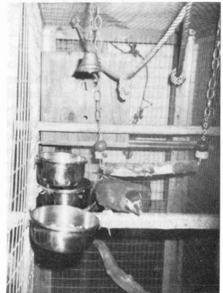
Midget fiercely guards her nest when nestlings are inside. Yellow-collared Macaws can adapt quite well to human surroundings as seen in these photos.