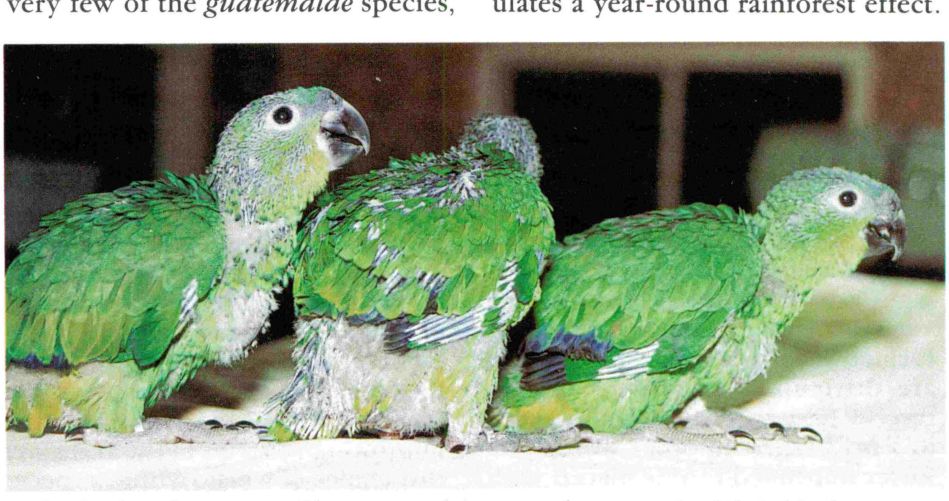
At feathering, these young Blue-crowned Amazons have acquired their black pigmented mandibles and the bluish forehead.