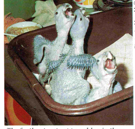
The feather tracts appear blue in these young guatemalae Blue-crowned Amazons. At pinfeather stage, these young Amazons are very vocal and alert.

An automatic sprinkler system simulates a year-round rainforest effect.