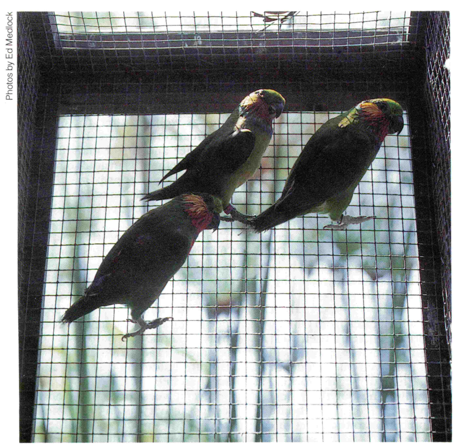
Female Fig Parrots show a slightly wider strip of blue under the neck and no red crosses over the blue border. Their breasts are chartreus green, in contrast to the male's ample showing of red below the blue strip.