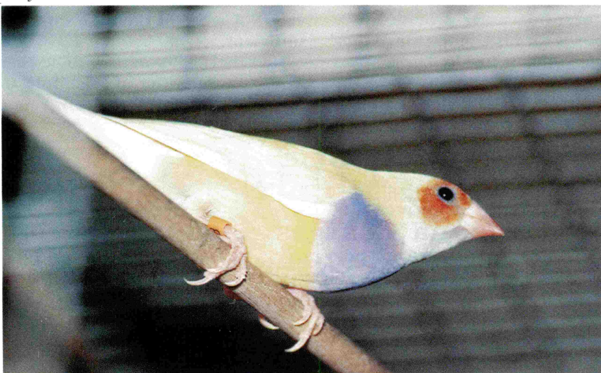
Yellow-backed mutation of the Lady Gouldian