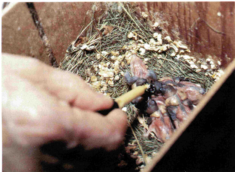
Handfeeding starts with nestling Lady Gouldians.