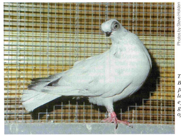
This stork Budapest cock possesses those large bulging eyes — a distinguishing feature of the breed.

The Budapest "short-faced" tumbler really does have a short face. This is due mainly to the fact that a good specimen possesses a very short, straight, black beak. His eyes could easily belong to a frog, for they bulge in the same froglike manner. A third bulge juts from out the back of his skull, giving him that "extraterrestial" look. It is not likely you'll see a Budi in red or yellow, for there are only three recognized colors in the local showrooms. These colors are blue, a blue bird with black wing bars, grizzle, and stork, a white bird with traces of gray-black on several primaries and the tail. Although the bird is slight, weighing anywhere from