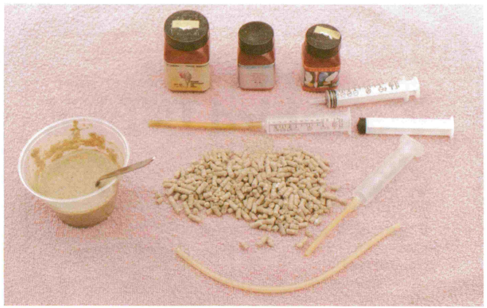
Vitamins, pigeon pellets, rubber tubing and a couple of good syringes enable nearly anyone to feed a young, abandoned squab.