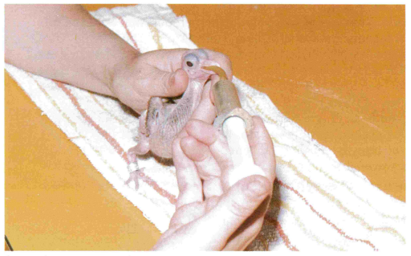
Some pigeons are easy for one to feed.

Other pigeons are more than one person can adequately handle. Author resorts to a 'strangle hold.''