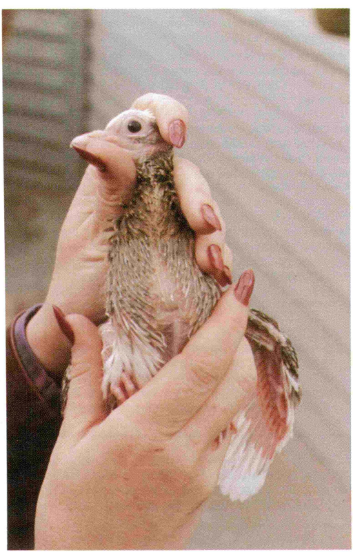
This two and a half week old squeaker has a flat crop and not enough skill to eat on his own.

Note: In this article I stress feeding birds of four days of age and older. Normally birds that are weak prior to this development may prove too much for a novice in terms of the physical feeding process (this is not to say that it is impossible, just far more risky). ●