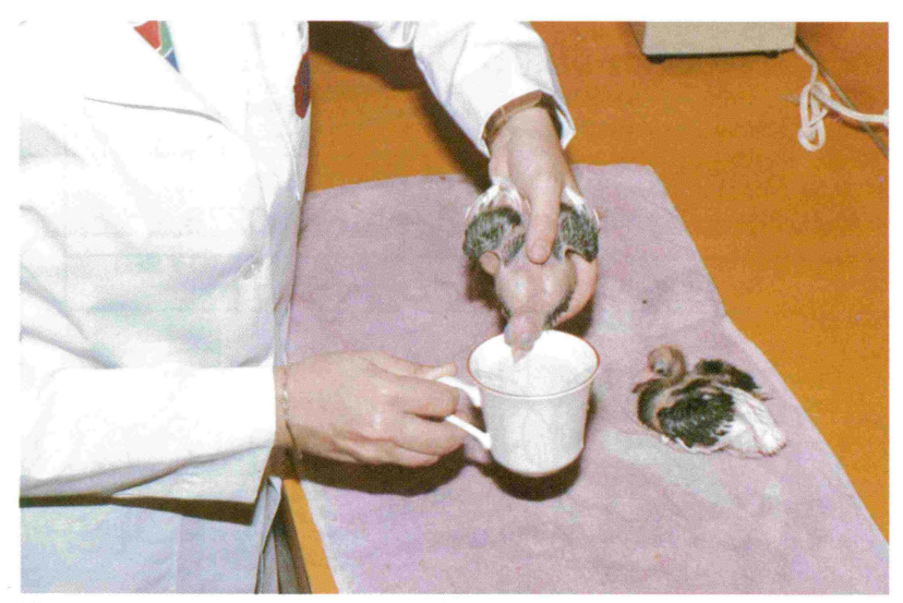
These young pigeons are taught to drink water from a cup.