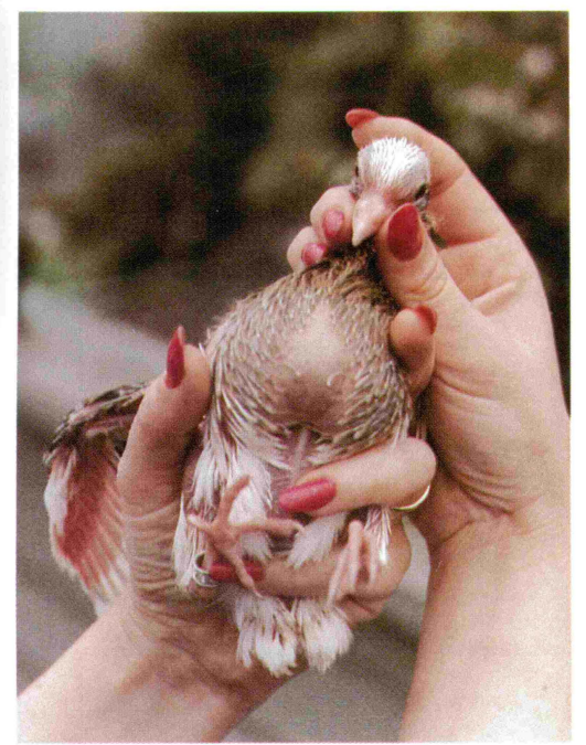
The crop should be gently rounded when feeding is complete.