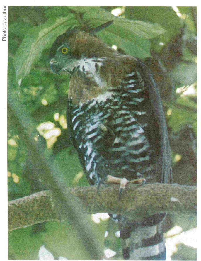
The ornate hawk-eagle inhabits tropical forests from Mexico to Argentina.

Due to its ability to adapt to disturbed forests the future of the black hawk-eagle appears brighter than most hawk-eagles.