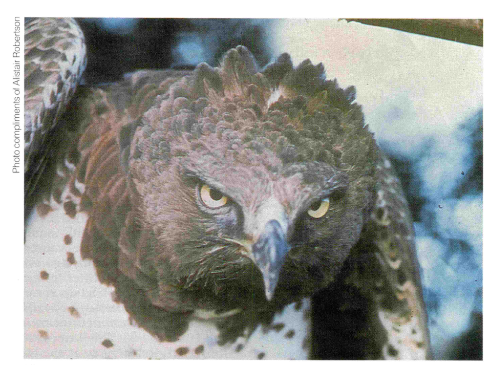
The largest of the hawk-eagles is also Africa's largest eagle, the martial eagle.

While birds of prey often conflict with our avicultural efforts, I am hopeful that our personal "tastes" will not dictate which species will find room in our modern day arks. Through education, scientific research and captive propagation not only will the future survival of the popular species of parrots and birds of paradise be secured but that of the magnificent hawk-eagles as well.